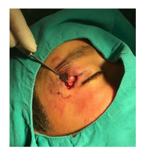
Figure 3. Intraoperative appearance of the cyst wall.

Written consent was obtained from the patient's parents for the publication of this case report and any accompanying images.