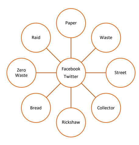
Figure 1: Keywords Used in Search for the Posts on Street Collectors