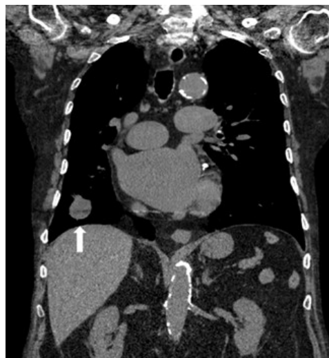
Figure 3: Coronal plane imaging of the patient. The computed tomography scan of the thorax shows a hydatid cyst (Arrow).