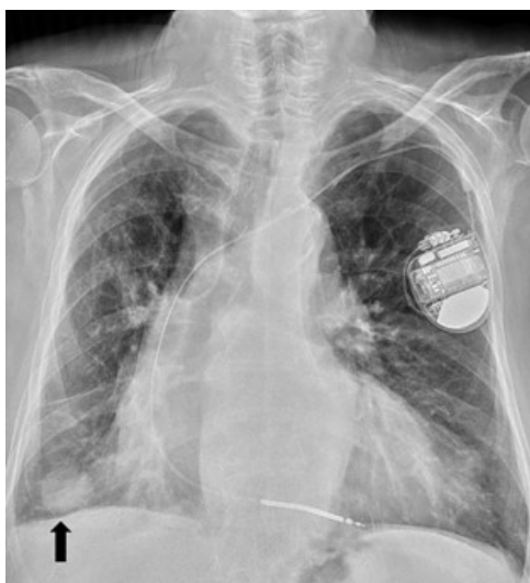
Figure 1: Posteroanterior chest radiography revealing hydatid cyst (Arrow).

Following the diagnosis of a hydatid cyst, the patient was offered the option of surgical removal of the cyst, which he declined due to the high risk of the procedure. Subsequently, the patient was prescribed 400 mg of albendazole and was advised to have regular check-ups. In the long term, he showed no further signs and symptoms of hydatid cyst. The hydatid cyst was neither removed nor disappeared, and it continued to be visible on radiological follow-up examinations (Figure 3). His hospitalizations related to heart failure continued, and the patient died in the cardiology department one year after the diagnosis of his hydatid cyst.