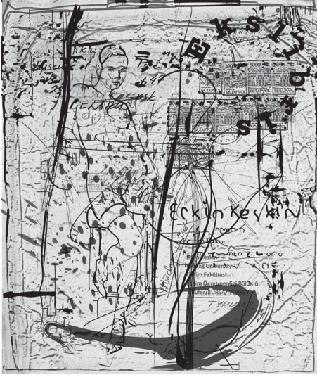
Image 1 A rough drawing for the exlibris the artist made for his own name, 2014.