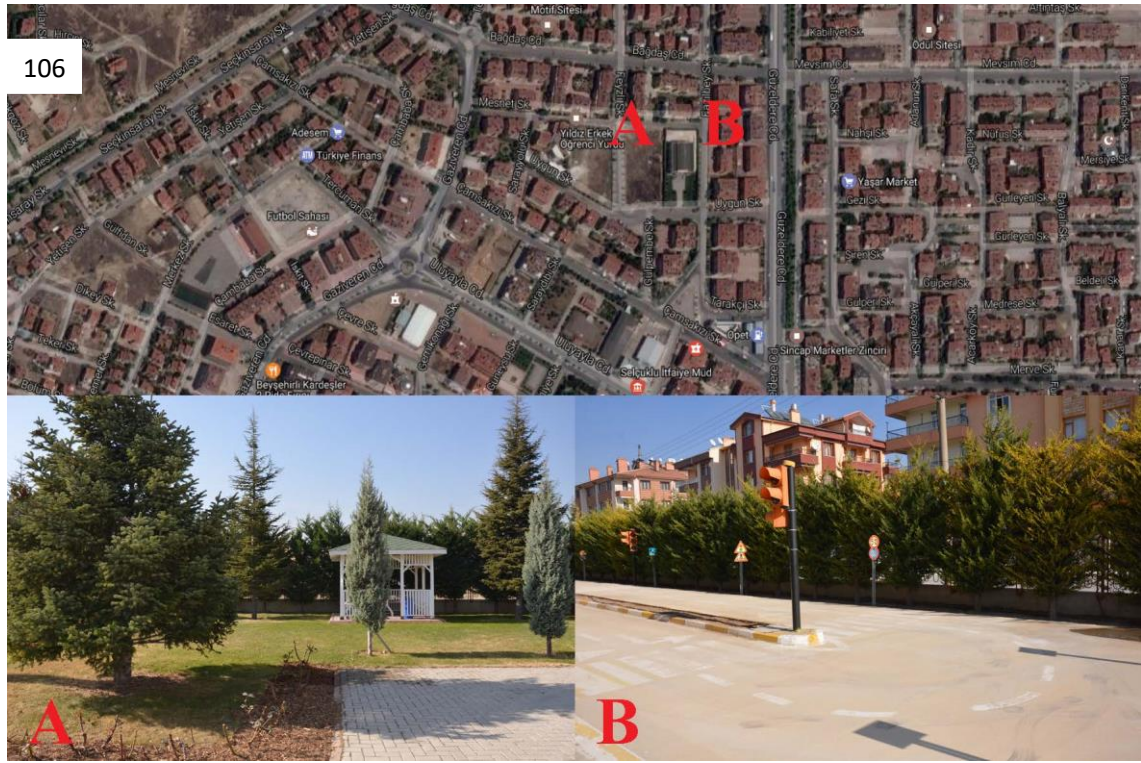
Figure 4. Google view of Şehit Demet Sezen nursery school.