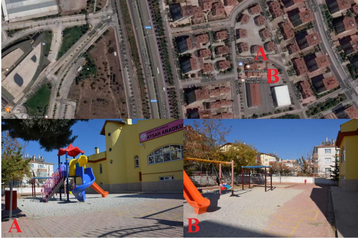
Figure 3. Google view of Ayşah nursery school. Şekil 3. Ayşah Anaokulunun Google map görüntüsü

In addition, only 3 out of 7 nursery schools had sand play areas. They are Ayşah, Şehit Hava Pilot Teğmen Ayfer Gök, and Şehit Demet Sezen nursery schools. Figure 3 shows the satellite image of the Ayşah nursery school and pictures taken from the marked places A and B.