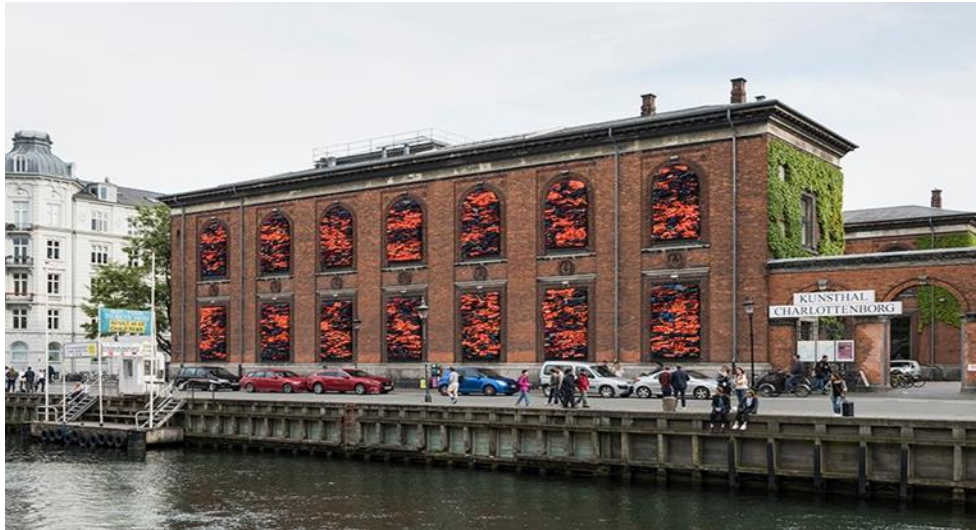
Image 3. Ai Weiwei, Soleil Levant , Installation, Kunsthall Charlottenborg, 2017, Photo: David Stjernholm.

Chinese dissident artist Ai Weiwei sends a remarkable message to the public, covering the windows of the Kunsthall Charlottenborg Museum with 3,500 life jackets worn by refugees gathered on the Greek Island of Lesbos.