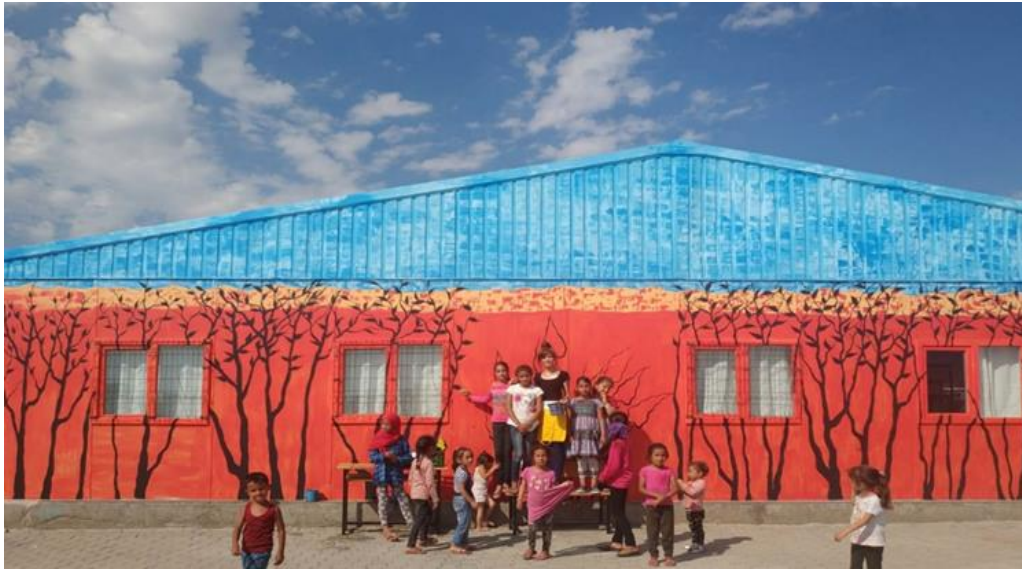
Image 6. Saime Uyar, 2019. (Malatya Refugee Camp, Turkey). (Acrylic Paint on the Surface of the Wall) (2.7 m x 14.50 m).

studies, it has been revealed that art is much more necessary, especially for children who are exposed to war and violence.