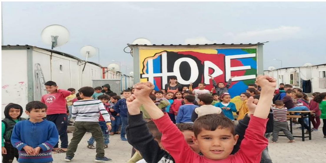
Image 7. Saime Uyar, 2019. (Malatya Refugee Camp, Turkey). (Acrylic Paint on the Surface of the Wall) (3m x 7m x 2,4 m).

These artistic works carried out in the camp have not only touched the deteriorated moods of the refugees but also improved the environment in which they live every day. However, another important contribution is that they are on a common platform with the citizens of the host country. In addition to the feeling of trust given by the door opened by the Republic of Turkey to them, the sincere and warm approaches of the people contribute positively to their integration process.