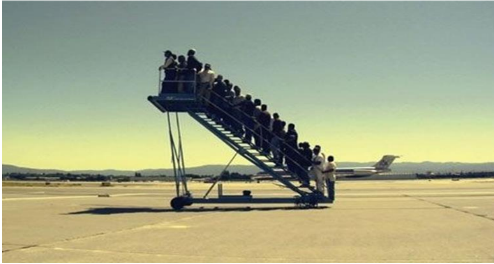
Image 2. Adrian Paci. Temporary Permanence Center 2007. https://bit.ly/2MitF2G

The Calais camp has hosted approximately 7,000 migrants and refugees, mostly from Syria, Afghanistan and Eritrea. Addressing the harsh living conditions of refugees in the camp as well as the racist attitudes directed at them, Banksy (2015) stated that he aims to draw attention to the benefits of migration by carrying out studies that break the prejudices of host country citizens towards refugees. Drawing attention to the richness of the difference, Banksy (2015) states that they are always directed to be convinced of the harmful sides of migration. However, he points out that Steve Jobs also comes from a Syrian immigrant family and creates one of the most profitable companies in the world Apple. With the Steve Job's example, he clearly argues that the doors to immigrants should not be seen only as a damaging factor to the country's resources (Banksy, 2015).