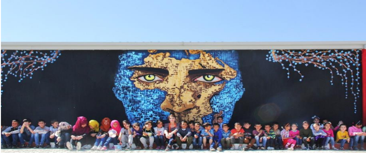
Image 8. Saime Uyar, 2019. (Malatya Refugee Camp, Turkey). (Acrylic Paint on the Surface of the Wall) (1000 cm x 270 cm).

As the voice of the silent scream of millions of desperate migrants and refugees around the world in the face of all this, art will take its place among the most objective witnesses of the age with the visual records it will leave to history. The work in Image 8 was dedicated to all refugees living in different geographies. "Every work we did in the camp was carried out in such a way that refugees could express their feelings and thoughts freely. We tried to focus more on promising, peaceful themes. We needed the colors, the warmth, to destroy the coldness of the war. However, in this study, the common feelings of all refugees were expressed as a cry of the lives destroyed, left unfinished and torn apart by the war. " (Saime Uyar).