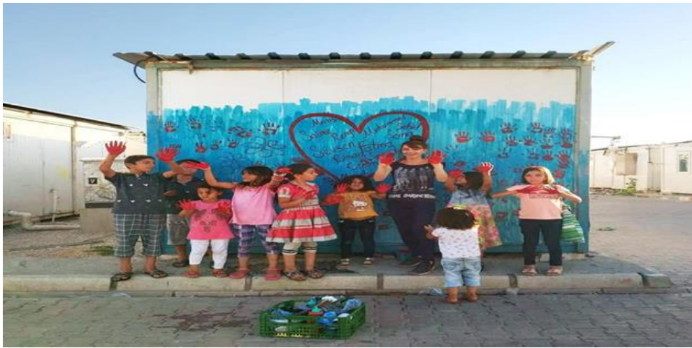
Image 5. Saime Uyar, 2019. (Malatya Refugee Camp, Turkey). (Acrylic Paint on the Surface of the Wall) (3m x 7m x 2,4 m).

In the work in Image 4, the slogan "Let the wars end and children be happy" expressed by Syrian refugees in their mother tongue is included.