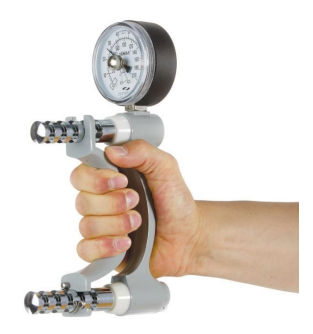
Figure 1. Jamar hydraulic hand dynamometer used for hand grip strength assessment.