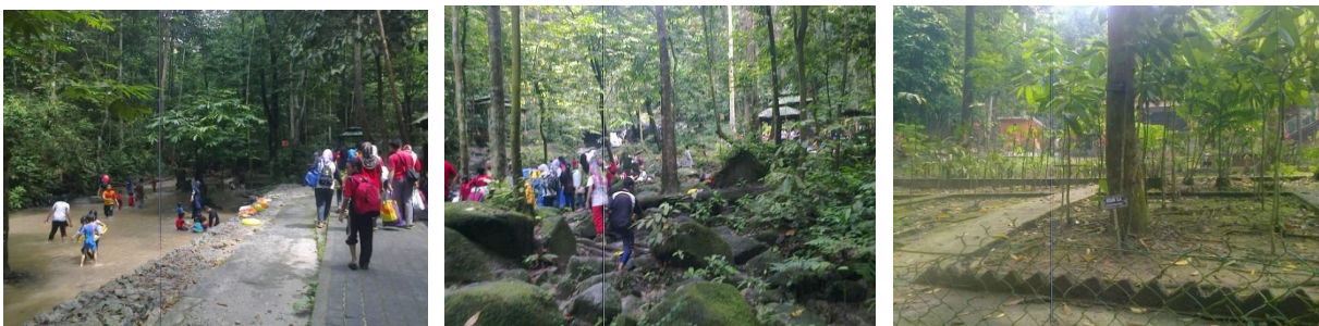
Photo 1: The beauty of Malaysia's recreational forests landscape has attracted people to visit the site and required proper management planning to ensure their sustainability.

However, how stake holders perceive recreational forest landscape planning is still in question. Therefore, this study tries to comprehend a stakeholder perception towards recreational forest landscape planning related to planning implementation, development approach, facility development and criteria's that can pursue to sustainable planning approach. By understanding stakeholder perception, a more sustainable planning approach can be developed for the comfort of users and the environment in the future. Objectives of the study was to analyze stakeholders' perception towards sustainable recreational forest landscape planning in order to benefited to future development in terms of environment, social and economy. Stakeholders in this study are referred to the management staff, local resident and user.