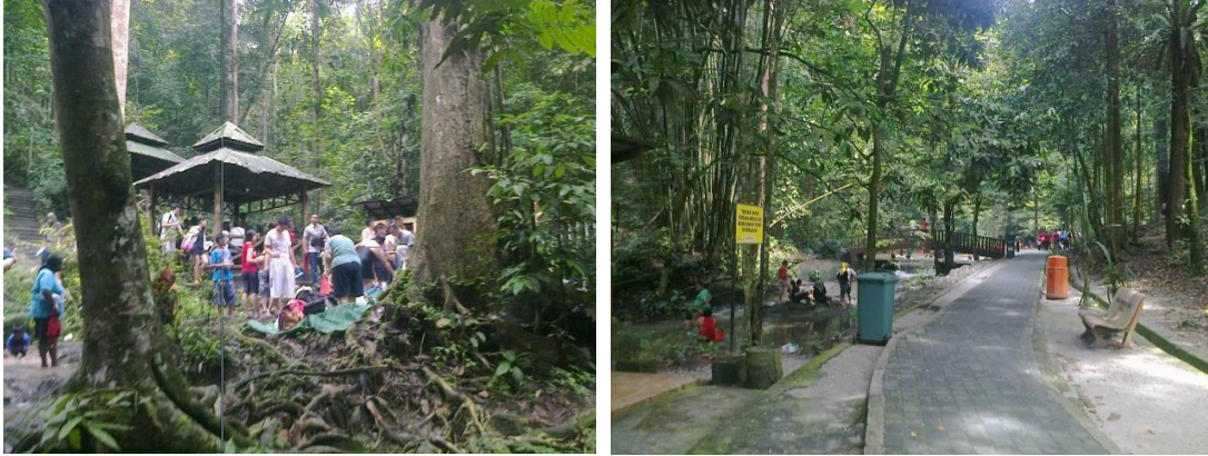
Photo 3: The design of human made landscape elements in recreational forest should apply ecofriendly and harmonize designs with surrounding environment as well as with local design enhancement.

In terms of design planning, more than majority of KP (81.4%) and more than half of PHR (62.5%) perceived that the designs should apply ecofriendly and harmonize designs with surrounding environment. However, half of PS (51.1%) perceived with local design enhancement (Table 6). Both designs actually fulfill and follow sustainable landscape characteristics due to it portrays unique approach in relationship with environment (Schenaidner 1981; Rykwert 1972). However, the most important things for related parties to take into account is they should implement sustainable landscape principles and standard requirements in serious ways especially in planning, implementation, management and landscape maintenance in order to achieve recreational forest sustainability (Beamiss 1987; Riry Zaimora 2006).