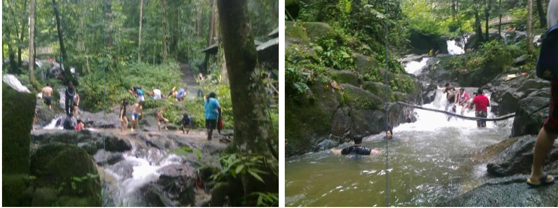
Photo 2: Nearly all recreational forest landscapes are judged and enjoyed according to the degree that they clearly exhibit care.

In terms of planning approach, results have shown that 25 - 50% respondents perceived that landscape development of study sites were carried out base on ad hoc or insitu planning approaches (Table 3). This result has close related with Chee (1986) statement where he argued that the development of recreational forest in Peninsular Malaysia was implemented through ad hoc approach and without overall development plan. In addition, it's also related with users' perception on the condition of infrastructures in recreational forests that has been perceived by them as under their satisfaction (Roshanim dan Fazidah 2008). But, majority KP (71.6%) and more than half of PHR (68.6%) as well as less than half PS (44.4%) mentioned that landscape development planning of recreational forest is based on master plan (this result is in line with analysis on Table 2). Based on this result, the management must take serious action to transform their development strategy by developing overall landscape master plan. Otherwise the issue of ad hoc or insitu development will be continued even though the parks had been established for more than 47 years in Peninsular Malaysia.