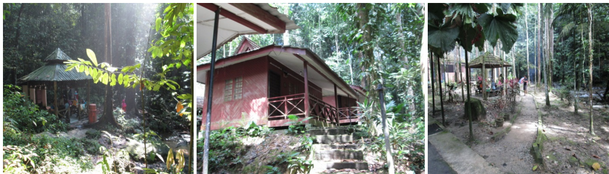
Photo 4: The development of human landscape elements of recreational forest should followed several criteria's to avoid abandonment syndrome such as portray local design and enhancing surrounding environment

In term of construction materials aspect, majority respondents (KP - 92.7%; PS - 91.1%; PHR - 95.0%) perceived that the materials used must be local materials (e.g. wood, bamboo, paddy hay, nypha leaves and others) (Table 7). Lippsmiller (1997) and Schmid (1983) encourage the use of local materials for construction works in protected area for sustainability purposes. On the other hand, majority respondents (KP - 84.1%; PS - 96.7%; PHR - 98.3%) also agreed that color application on structural in recreational forest should apply natural colors such as brown and green (Table 7). Basically, natural colors are much suitable for forest environment due to the fact that those colors are calm and peaceful (Brenda and Robert 1996 in Riry Zaimora 2006). Majority of the respondents (KP - 84.2%; PS - 94.5%; PHR - 95.6%) also perceived that structural design should portray special characteristics of forest that only can be found in recreational forest (Table 7). Noorizan (2004) argued that enhancing special characteristics of recreational forest is necessary because it can control the important of history value, cultural, conserving ecosystem and aesthetic values, increasing economy and tourism sector as well as can educate the publics.