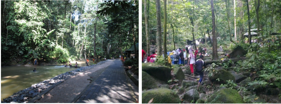
Photo 5: People's perceptions towards recreational forest landscape are difference because people always have different attitude, norm, desire and taste that are always change according to time