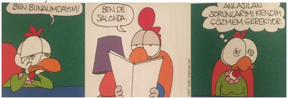
Fig. 15: Çıtçıt's depression ( Sihirli Annem , 8).

As a result of devoting herself to her husband and daughter, Çıtçıt, in the end, feels pitiable and gets depressed confessing that she is fed up with dealing with the same things every day. She finds her life meaningless; she looks to her husband to heal her soul and rise out of the depression. Unhappily, she again faces the fact that she is alone to overcome this process. She is hopeless and helpless just as she feels throughout her married life. When she says that she is in depression, her husband says he is in the living room, in a manner quite away from trying to understand and pay attention to what she says.