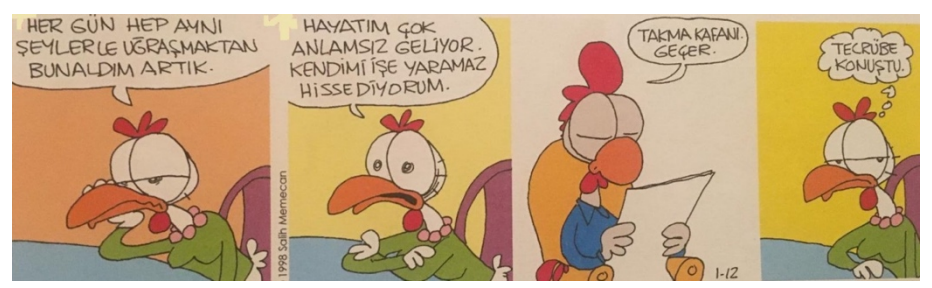
Fig. 16: Citcit feels fatigued because of the meaningless life (Sihirli Annem, 9).

Throughout the selected panels, Çıtçıt's life only consists of the monotonous repetition of the things. As her identity is stuck between a wife and mother, she is unable to do something for herself. As a result of this monotonous way of life, getting into a kind of depression becomes an inevitable ending for her.