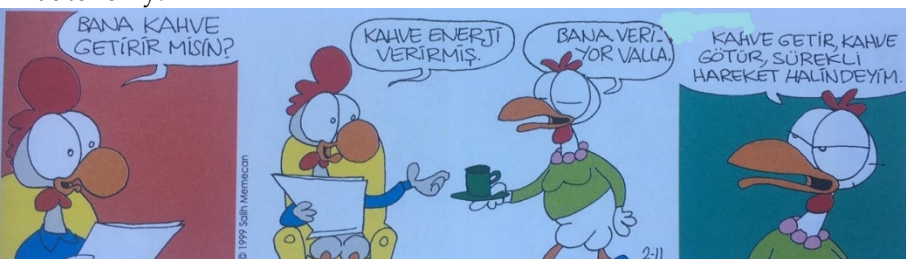
Fig. 9: Çıtçıt's complaint about serving her husband ( Sihirli Annem , 15).

When a man has a wife to keep his home, care for his children, cook his meals and so forth, he himself becomes freed up for more meaningful activity at home or in the world [...] having a wife who ministers to the life process nevertheless enables husbands to unload the tedious varieties of housework onto a female Other and to increase their own autonomy.<sup>20</sup>