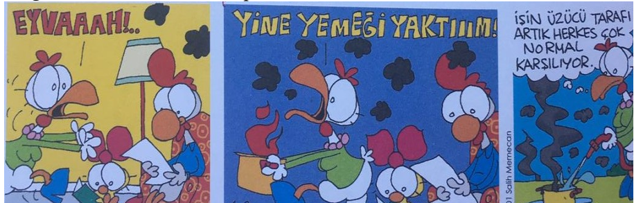
Fig. 14: The scene that Çıtçıt burned the food (Sihirli Annem, 32).

As a result of devoting herself to her husband and daughter, Çıtçıt, in the end, feels pitiable and gets depressed confessing that she is fed up with dealing with the same things every day. She finds her life meaningless; she looks to her husband to heal her soul and rise out of the depression. Unhappily, she again faces the fact that she is alone to overcome this process. She is hopeless and helpless just as she feels throughout her married life. When she says that she is in depression, her husband says he is in the living room, in a manner quite away from trying to understand and pay attention to what she says.