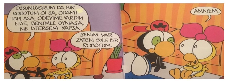
Fig. 11: Limon's mention her mother as a "robot" (Annem, 1).