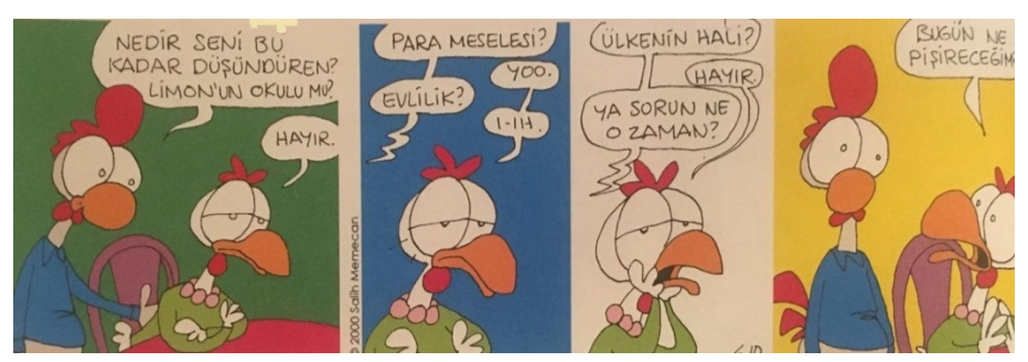
Fig. 13: Çıtçıt's mental entrapment in household chores (Sihirli Annem, 24).