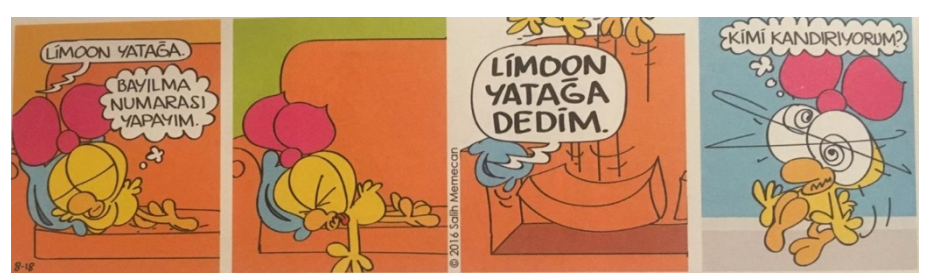
Fig. 8: Çıtçıt's growing impatience to put Limon to sleep (Annem, 62).