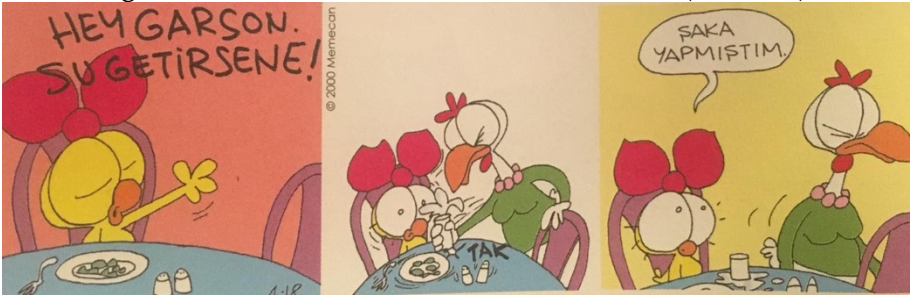
Fig. 12: Limon's calling her mother "server" (İşte Benim Annem, 7).

Other than the physical wariness due to being stuck in the house, Çıtçıt is also mentally tired. There are few panels in which Çıtçıt is seen outside due to the burden of endless housework. She keeps herself so busy with the chores that she tends to get depressed just because she cannot think of anything to cook. She is shown to make the problem with the meal so gross that it even surpasses the thoughts and other problems in life when her husband asks her what makes her think so deeply. Portrayed as an individual devoted to working for others, she stays behind daily matters being unable to think that she indeed exists as an individual. In figure 12, it is obvious that it is not quite easy to plan the meal every day and as like the several other domestic matters it also "imprisons her in repetition and immanence, repeated from day to day in an identical form, without change and producing nothing new"<sup>21</sup>.