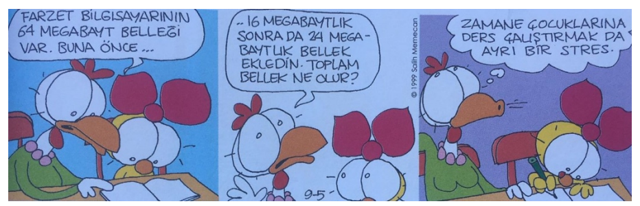
Fig. 4: Çıtçıt studying together with Limon (Sihirli Annem, 19).