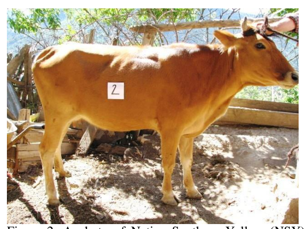
Figure 2. A photo of Native Southern Yellow (NSY) cow