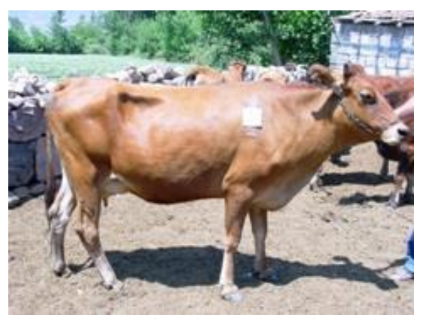
Figure 1. A photo of South Anatolian Red (SAR) cow

Body measurements of two cattle types were analyzed by independent two-sample t-test for each age group and the overall means according to statistical model given below in SPSS 12.0 Program.