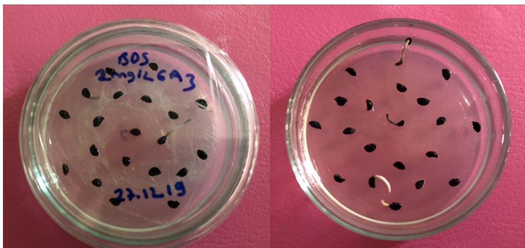
Figure 2. Germinated seeds in BDS medium treated with 2 mg L -1 GA 3