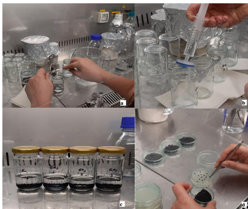
Figure 1. a) Sterilization of seeds, b) Filter sterilization of GA 3 solutions, c) Seeds treated at different GA 3 concentrations for 48 hours, d) Cultured seeds.

sterilization, and then washed three times for three minutes with distilled water (Kizil et al., 2017). In order to promote germination, different concentrations of GA 3 (2 mg L -1 , 3 mg L -1 and 4 mg L -1 ) were applied to the seeds for 48 hours under sterile conditions. Then the seeds were cultured on BDS (Dunstan and Short, 1977) and MS (Murashige and Skoog, 1962) medium supplemented with 2.0% sucrose at 4 °C (Kizil et al., 2017), with 15 replications from each application and 15 seeds in each replication under in vitro conditions (Figure 1). 2 mm rootlets were accepted as germination criterion (Anonymous, 1985; Figure 2).