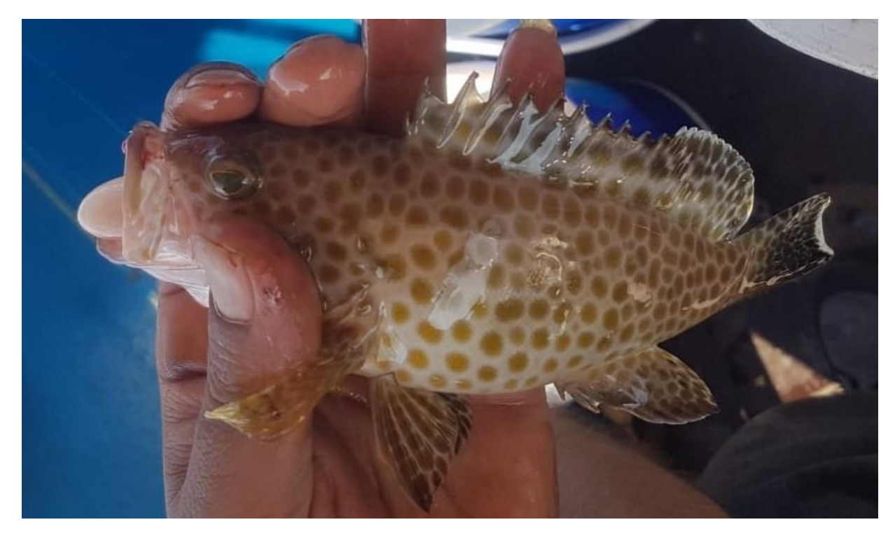
Figure 2. Orange spotted grouper Epinephelus coioides (Hamilton, 1822) captured from the Iskenderun Bay, Turkey.