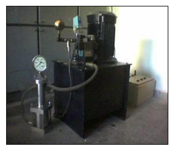
Fig.1. Hydraulic pressure unit.

Early pressure shocks of 7,000 psi were applied by using a hydrostatic unit (Fig. 1) for 4 min at 35, 40 and 45 min after fertilization.