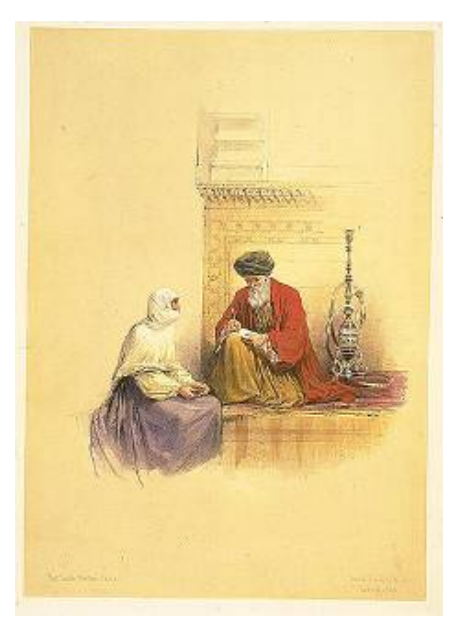
Pic.4- D.Roberts, Letter Writer, 1838