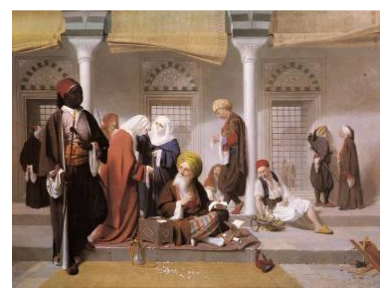
Pic.9- W.Gould, The Public Scribe, 1869, oil on canvas, 109.2 x 139.1 cm., New York Christie's (G.M.Ackerman; American Orientalists , Paris 1994)