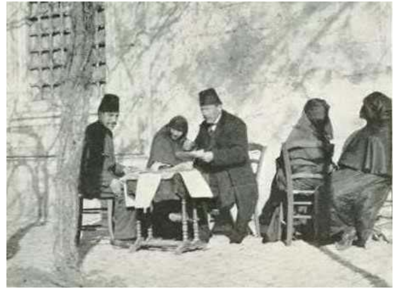
Pic.11- Martimer Fox, photograph, İstanbul 1915, National Geographic Society Image Collection ( Bak Bir Varmış Bir Yokmuş- İmparatorluk'tan Cumhuriyet'e İstanbul- National Geographic Fotoğraflarıyla , İstanbul 2000)