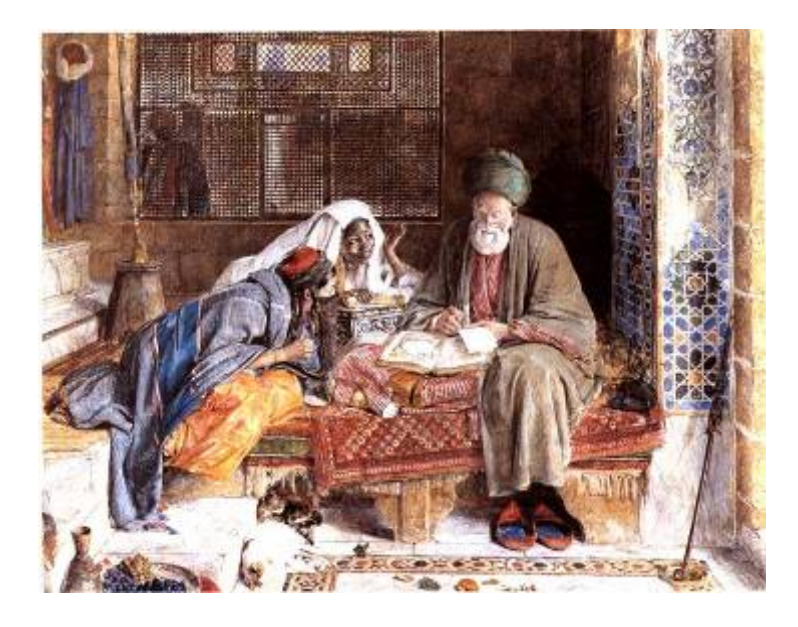
Pic. 7- J.F.Lewis, The Arab Scribe-Cairo, 1852, water color, 46.3 x 60.9 cm. (S.Germaner, Z.İnankur; Oryantalistlerin İstanbulu , İstanbul 2002)