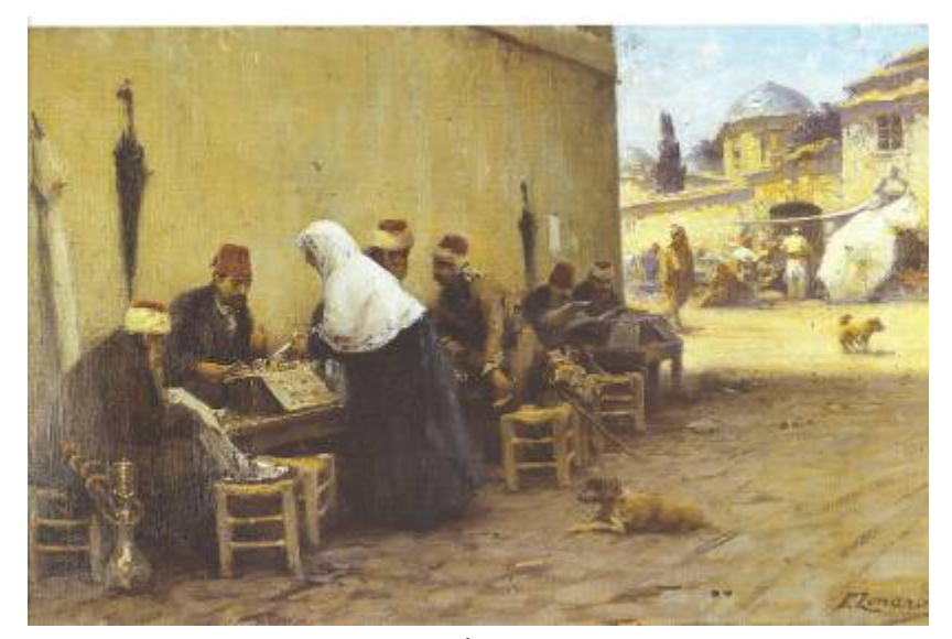
Pic.10- F.Zonaro, Scrivani Publici İstanbul, 1900, oil on canvas, 38 x 61 cm., Private Collection (O.Öndeş, E.Makzume; Osmanlı Saray Ressamı Fausto Zonaro , İstanbul 2003)