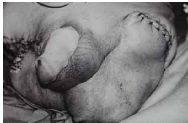
Resim 2: Preoperative appearance of the patient showing extensive soft tissue defect