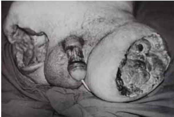
Resim 1: Preoperative appearance of the patient showing extensive soft tissue defect