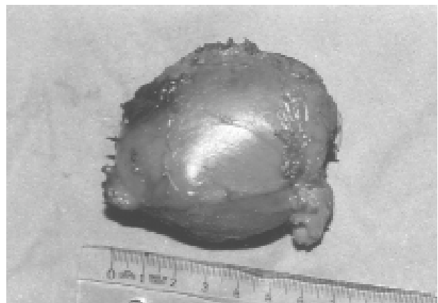
Fig. 2 - The appearance of the mass after surgical removal.