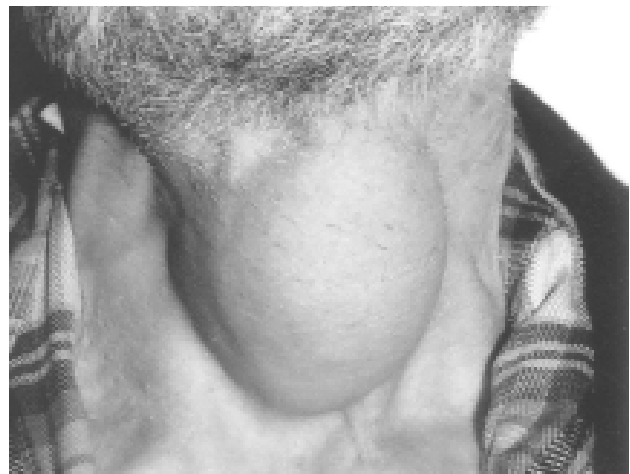
Fig. 1 - Preoperative appearance of the mass.

Thyroglossal duct cysts are usually found adjoining the hyoid bone (75%) as asymptomatic masses. [5] If the foramen cecum is patent, then fluid or inflam-