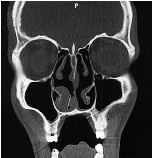
Fig. 2 - CT image, postoperative appearance, 18 months later.

Chiang et al., [4] believe that formation of the dorsal nasal cyst is similar to that of NSC. The NSC is probably caused by entrapment of free nasal mucosal remnants or inward folding of septal nasal mucosa during SMR. They explain that with two theories why the cyst could not cause any symptoms until 20 years after SMR. The first suggestion is that chronic rhinitis may stimulate the mucosal epithelium of postoperative septal space to undergo cystic degeneration. The second possibility is that blocked septal mucosa may go on making secretion and subsequently slowly accumulation of this causes cyst formation and expansion.