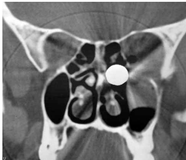
Fig. 1 - Coronal computed tomography scan showing the round foreign body in the left posterior ethmoidal sinuses.

With the advent of endoscopic surgery, removal endoscopically has become the approach of choice for the majority of cases of sinus foreign bodies. [3,6,7] Endoscopy allows for better evaluation of the size and location of the foreign body as well as relation to adjacent structures. It is important to achieve control of the structures surrounding the object prior to its removal. We also used an endoscopic approach while removing the ball bearing.