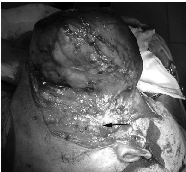
Figure 3. The image shows the facial nerve main truncus (black arrow) and its branches after shifting the mass anteriorly during operation.

giant encapsulated mixed-echo mass lesion with cystic and solid components on the left side of the face and neck. Computed tomography showed an encapsulated heterogeneous density mass lesion measuring 17x14x12 cm. There was no invasion