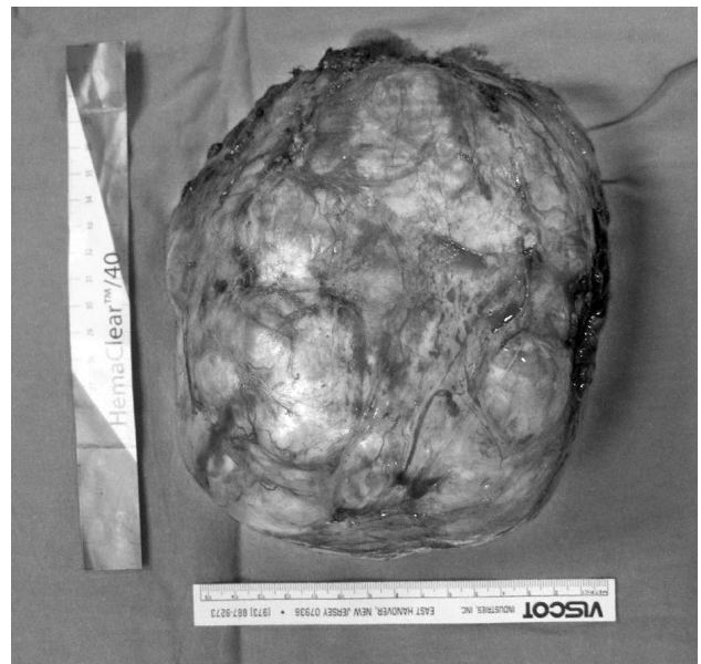
Figure 4. Macroscopically, the excised specimen is ovoid in shape. It measures 15x15x20 cm and weighs 1.6 kg.

The mass was excised by superficial parotidectomy under general anesthesia with preservation of the main truncus and the branches of the facial nerve (Figure 3). The functions of the facial nerve were normal in the postoperative period. The mass was bordered by the SCM posteriorly and masseter muscle