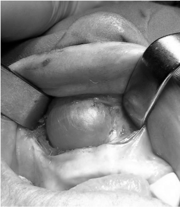
Figure 3. Perioperative photograph of the patient showing a smooth, well-circumscribed and translucent cyst.

well-circumscribed, fluctuant and translucent cyst that was approximately 3 cm in diameter (Figure 3). No adhesion to the underlying bone was encountered. The lesion was easily released from the bone, skin and the undersurface of the nasal mucosa and removed intact. The lesion produced pressure erosion of the underlying bone and expanded toward the nasal base of the maxillary alveolus. A spheric cavity was left behind after extirpation almost the same size as the lesion. The wound was closed by primary intention. The cyst