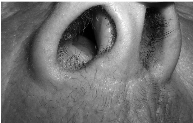
Figure 1. Preoperative photograph of the patient with a submucosal cystic mass under the right alar base.