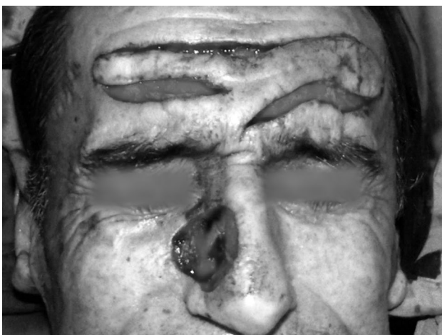
Figure 1. Flap of interest is removed at the contralateral side of nasal defect by parallel incisions to natural forehead creases in a full-thickness manner.

The supratrochlear artery is the dominant blood source in current forehead flaps. Thus, it is essential to know and preserve the anatomy of the supratrochlear artery. It leaves the orbit approximately 2 cm lateral to midline. It has a profound course in orbital and frontal muscles, while it superficially travels in the corrugator muscle. Then, it penetrates the frontal muscle medial to the eyebrow and projects in a subcutaneous plane. [7] Although all of the forehead