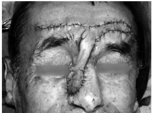
Figure 4. Area is primarily sutured from where the second flap was raised, while it is sutured to the area from where the original flap was raised.

paramedian flaps lie in the vertical plane, in the described modification using our technique, the flap handle with some part of the flap remains in the vertical plane. On the other hand the wings extending laterally remain transverse. Nourishment of these transverse wings is by random capillary circulation from the flap pedicle. Because of this reason this flap technique is named as a modification. Sufficient vascularity of the head and neck region provides flap wings with nutrition opportunity. As it would be seen from the postoperative image, good results and no flap necrosis were observed.