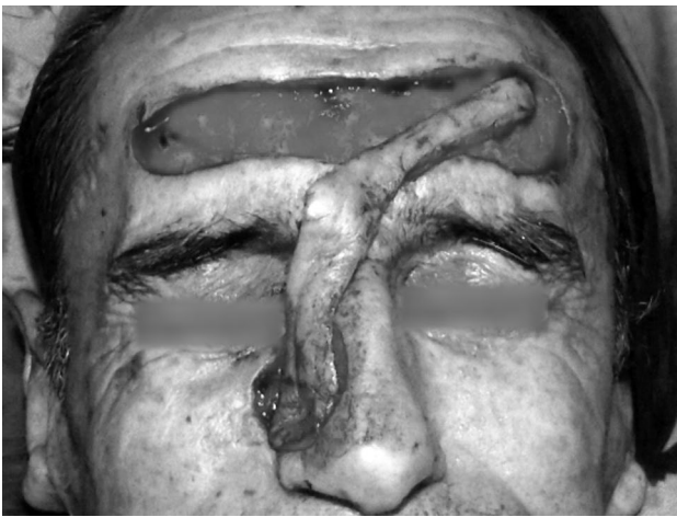
Figure 3. Second flap is sutured to the area from where the original flap was raised.