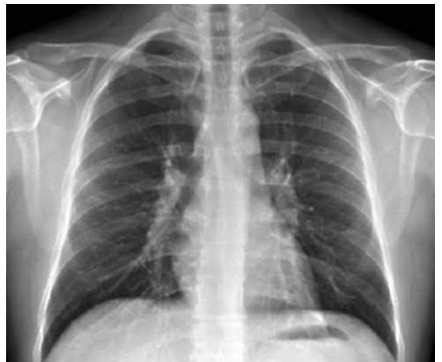
Figure 3. Chest X-ray, posterior-anterior view, showing hilar lymphadenopathy.

Many systemic diseases affect Waldeyer's ring and should be considered in the differential diagnosis, such as Tangier's disease (familial hypo-alpha-lipoproteinemia), tuberculosis, amyloidosis and metastasis from primary tumors as well as sarcoidosis. Children with Tangier's disease have enlarged, hyperplastic palatine and pharyngeal tonsils with yellow-orange or yellow-grey discoloration. Histologically, large groups and accumulations of macrophages with foamy cytoplasm can be identified in the palatine and pharyngeal tonsils. Isolated tumor-like involvement of the nasopharynx, of the entire Waldeyer's ring or the palatine tonsils without systemic disease is exceptionally rare. Amyloid deposition in Waldeyer's ring has been described in plasmacytomas, nasopharyngeal carcinomas