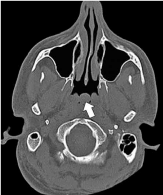
Figure 1. Computed tomography, axial section showing nasopharyngeal mass (white arrow).

limits. Paranasal computed tomography (CT) revealed a polypoid mass in the nasopharynx (Figure 1). Written informed consent for these procedures and their reporting had been obtained from the patient, and surgery was performed.