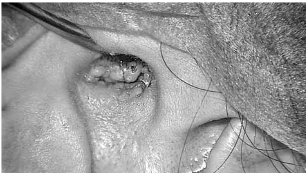
Figure 1. Skin-colored, verrucous, papillomatous lesion completely occluding the left external auditory canal.