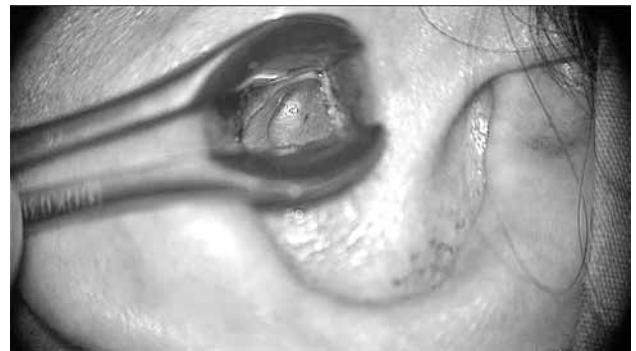
Figure 2. Left external auditory canal after CO 2 laser ablation surgery.

two years before, she presented with lesions in both EACs which were histopathologically diagnosed as SK by incisional biopsy and subsequently removed by electrocoagulation. Here, we chose flexible fiber delivered CO 2 laser (Omniguide Inc., Cambridge, MA, USA) to excise the recurrent lesions without performing incisional biopsy or radiological examination. After excision, both EACs seemed to be smooth and both tympanic membranes were intact. (Figure 2, for left EAC) Histopathological examination confirmed the diagnosis of irritated type SK (Figure 3a, b). There was no recurrence of disease on 12-month follow-up. Written informed consent was obtained from the patient.