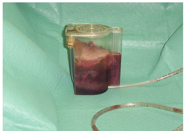
Figure 1c. Container of the negative pressure dressing 48 hours later the application. Note that 200 mL of formaldehyde was added to the container before starting the procedure to preserve fluid and tissue particles which would come from the wound.