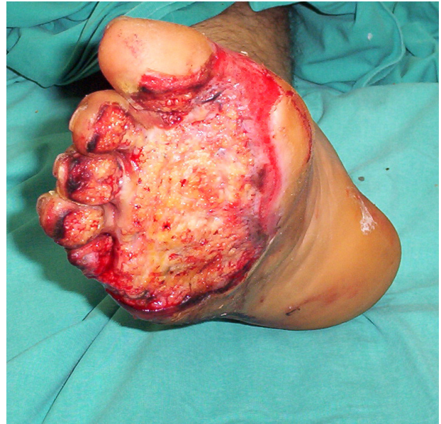
Figure 1a. Appearance of the right foot after extensive debridement of the deep necrosis due to high-voltage electrical injury. Note that excision of the necrosis was performed up to the viable-appearing and bleeding tissue without leaving significant necrosis.

As well known, none of the dressing types replaces the need of surgical debridement in the presence of significant necrosis, bacterial colonization and wound infection; however, dressing has an important complementary function in cleansing and protection of the wounds. 1-3 It may be considered as a mechanical and biological barrier between the wound and environment. All types of dressings can take out exudate, cloths, particles, foreign bodies, bacteria, tissue remnants and debris from the wounds gradually, eliminating their negative effects on wound healing. Apart from other dressing methods, negative pressure dressing makes those actively, possibly taking a shorter time than the others.