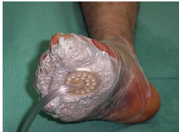
Figure 1b. View of the foot with the negative pressure dressing application.