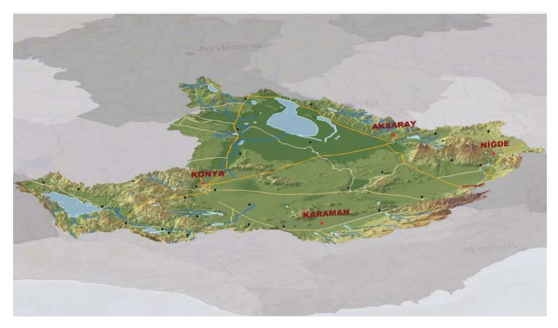
Figure 1. Geographic location of the trial site, (Berke et al., 2014)