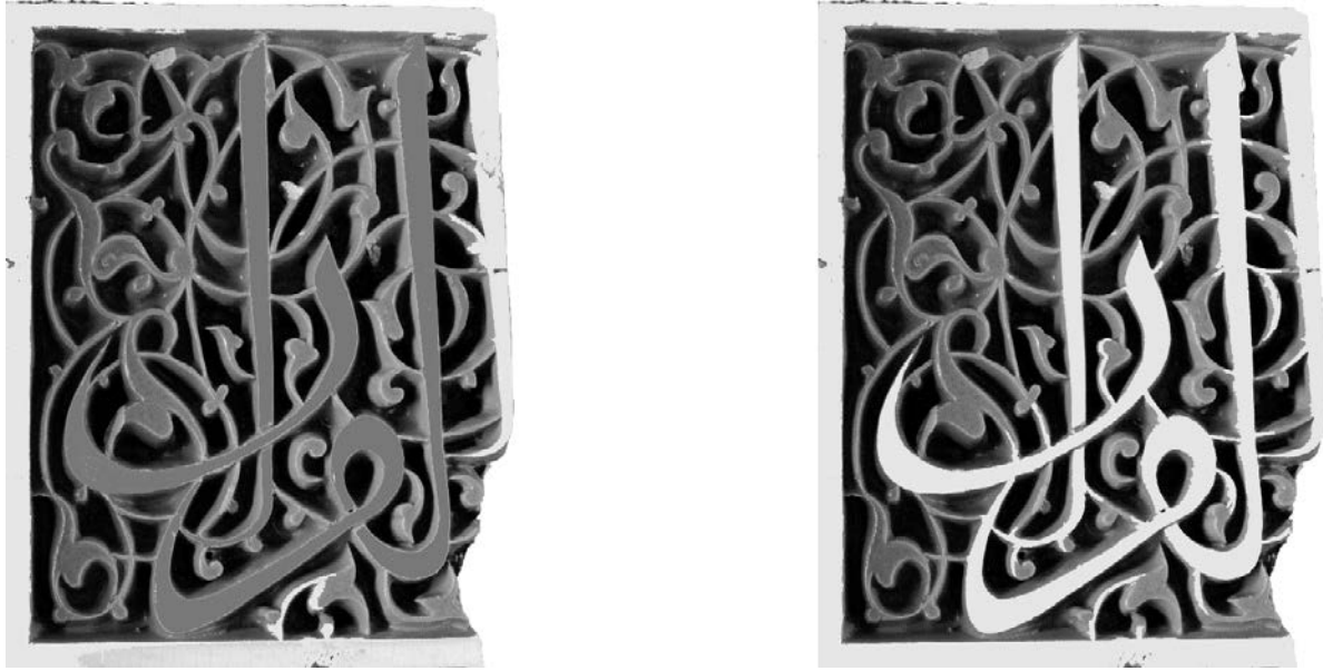
Fig. 1 Calligraphy on an arabesque background 19

We experience a raw flow of sense data of it, and we also conduct an interpretative act that endows it with the sense “arabesque.” Yet, at some point, we begin to realize that within the pattern lies something with linguistic or symbolic value (figure 1, right), and then our interpretative acts give it this other, additional sense (Husserl, 2001b, p. 105 [398]). That extra aspect of the design then stands out in our awareness, as we apperceive it in addition to our perception of the whole design, thereby providing this appresentative “ surplus ” to it (p. 105 [398]).