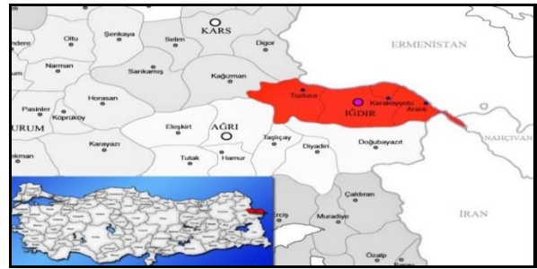
Figure 1. Iğdır map

The research material is the data obtained from 92 buffalo breeding businesses registered to the Iğdır Directorate of Provincial Agriculture and Forestry. Iğdır province, located on the eastern border of Turkey, is located between 39° 55' north latitude and 44° 02' east longitude and is at an altitude of 850 m. There is Armenia on the northern and northeastern border of Iğdır, Nakhchivan and Iran in the southeast and east (SERKA, 2021).