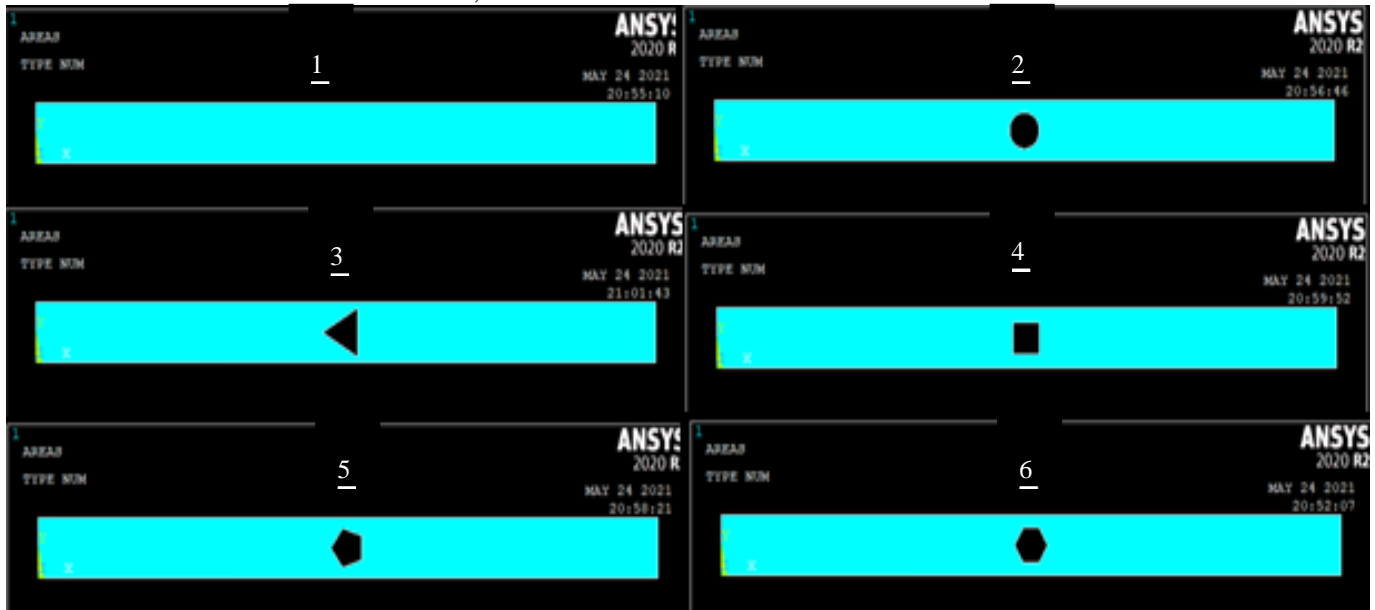
Figure 1 A schematic model of a sandwich structure. 1) no cutout, 2) circular cutout, 3) triangular cutout, 4) rectangular cutout, 5) pentagonal cutout, 6) hexagonal cutout.

thickness of PCV foam is 10 mm. The sandwich structure has a lay-up sequence (90°/0°/core/0°/90°).