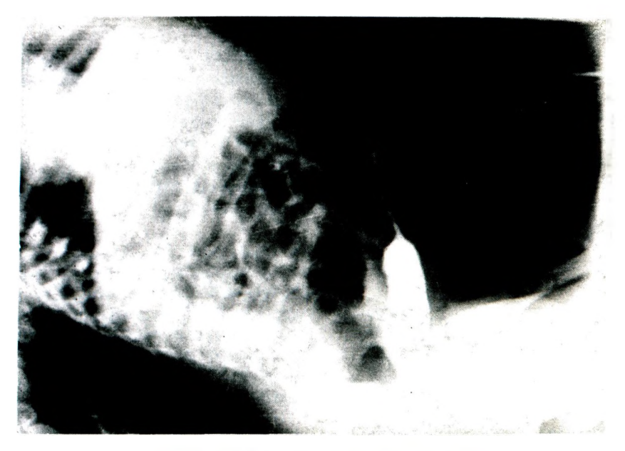
FIG 2. Fistulogram showing patent urachus.