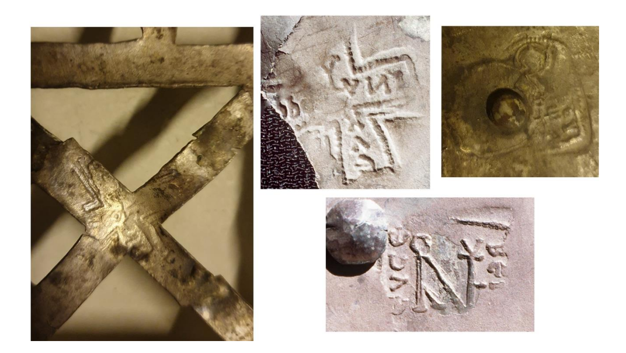
Figure 6. 5 Imperial Stamps of Rectangular Polycandelon (No. 12) from Antalya Museum.