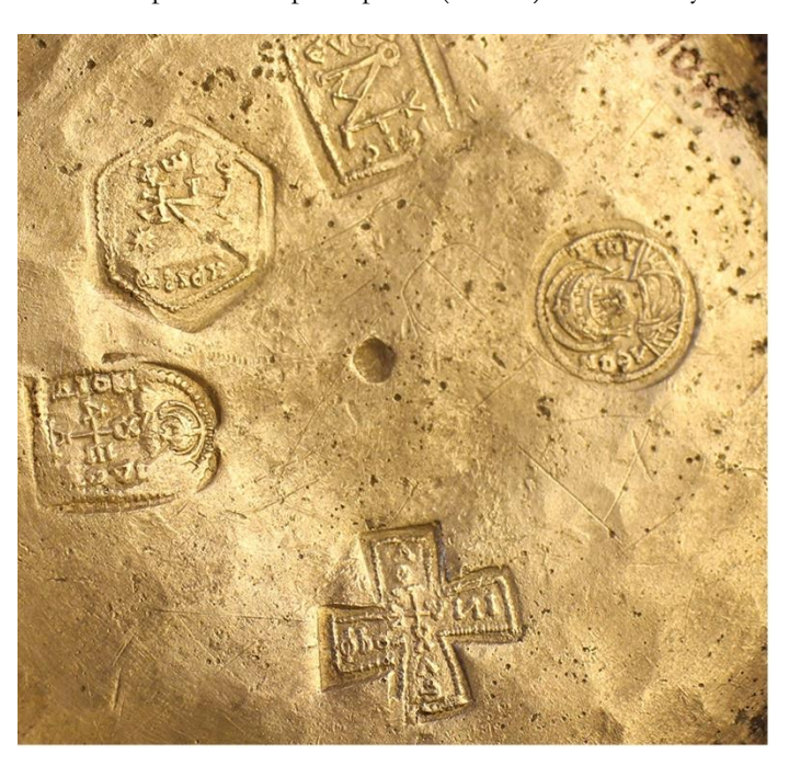
Figure 8. 5 Imperial Stamps of censer (No. 18) from Antalya Museum