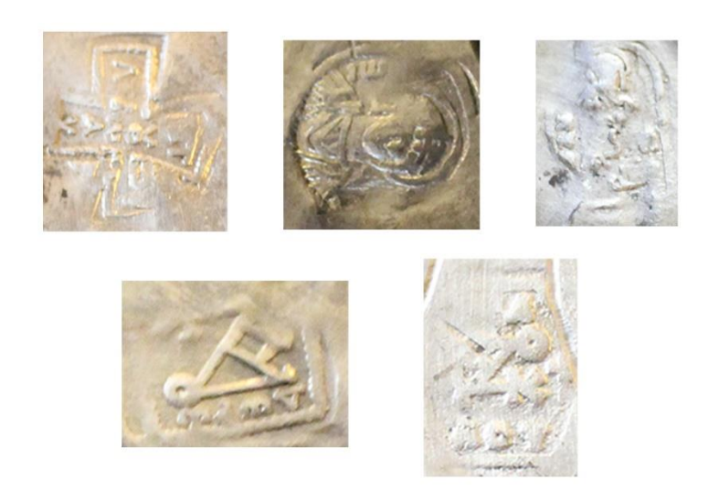
Figure 2. 5 Imperial Stamps of Curiciform Polycandelon (No. 2) from Antalya Museum