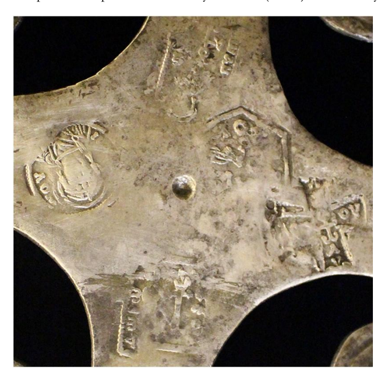
Figure 4. 5 Imperial Stamps of Circular Polycandelon (No. 5) from Antalya Museum