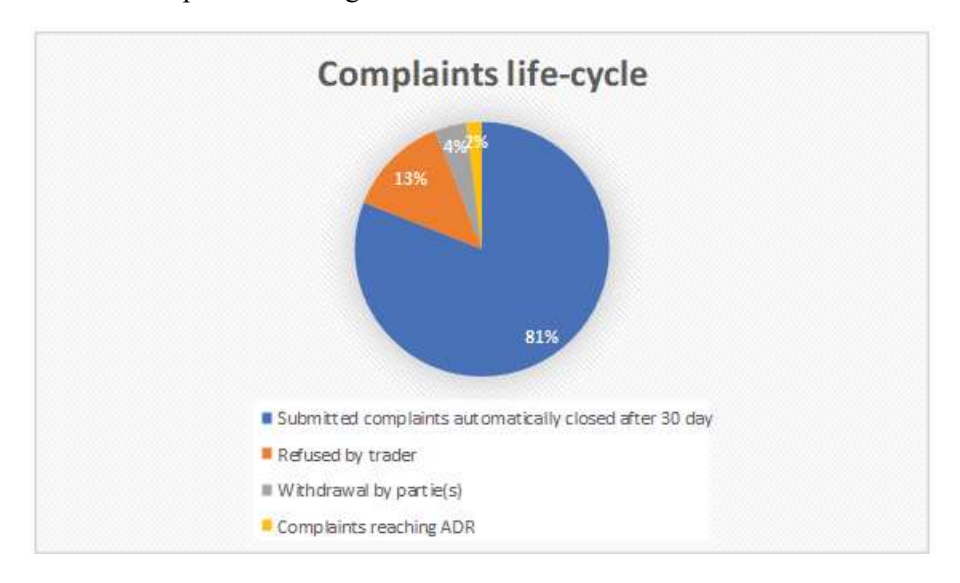
Table 3: Complaints life-cycle<sup>72</sup>

mission. The statistics, as given in the table below (table 3), show that 2% of the complaints reached a dispute resolution body after an agreement between the consumer and the trader and 81% of cases were automatically closed after the 30 days legal deadline<sup>71</sup>. It is worth noting here that, in order for the EU ODR Platform to be more efficient, it should be proposed that traders have to make either the platform or consumers aware by email whether or not they will participate in any ADR process. It will help the consumers know whether the case will proceed through ADR or not.