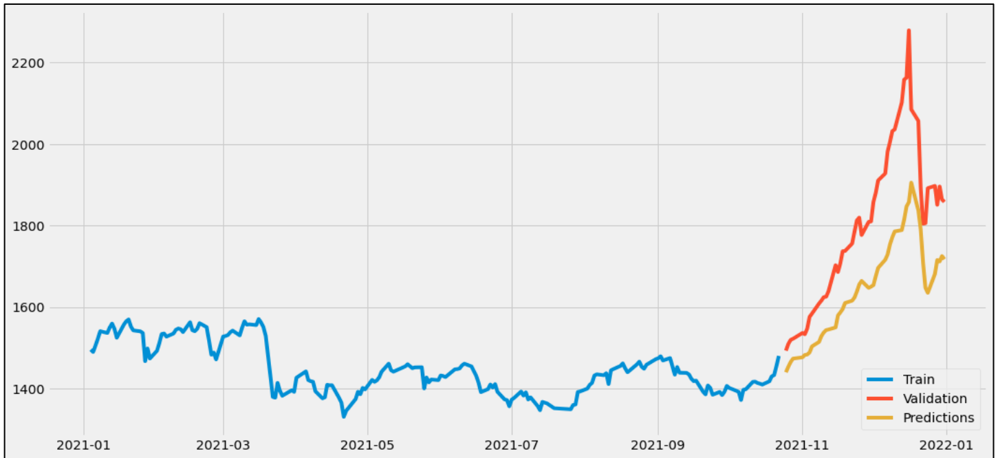
Figure 1. LSTM Data Visualization