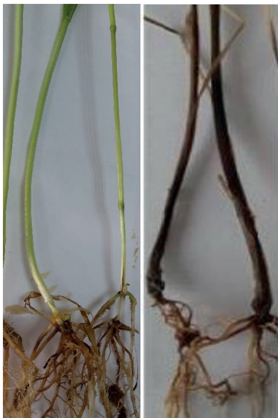
Figure 1. Resistant (left) and susceptible bread wheat genotypes (right) at seedling stage under growth room conditions

Wheat genotypes tested showed different reactions to the Fusarium pseudograminearum (Figure 1). Out of the 200 wheat genotypes tested; 1 (0.5%), 35 (17.5%), 112 (56%), 45 (22.5%) and 7 (3.5%) were resistant, moderately resistant, moderately susceptible, susceptible and very susceptible to F. pseudograminearum , respectively. The majority of the