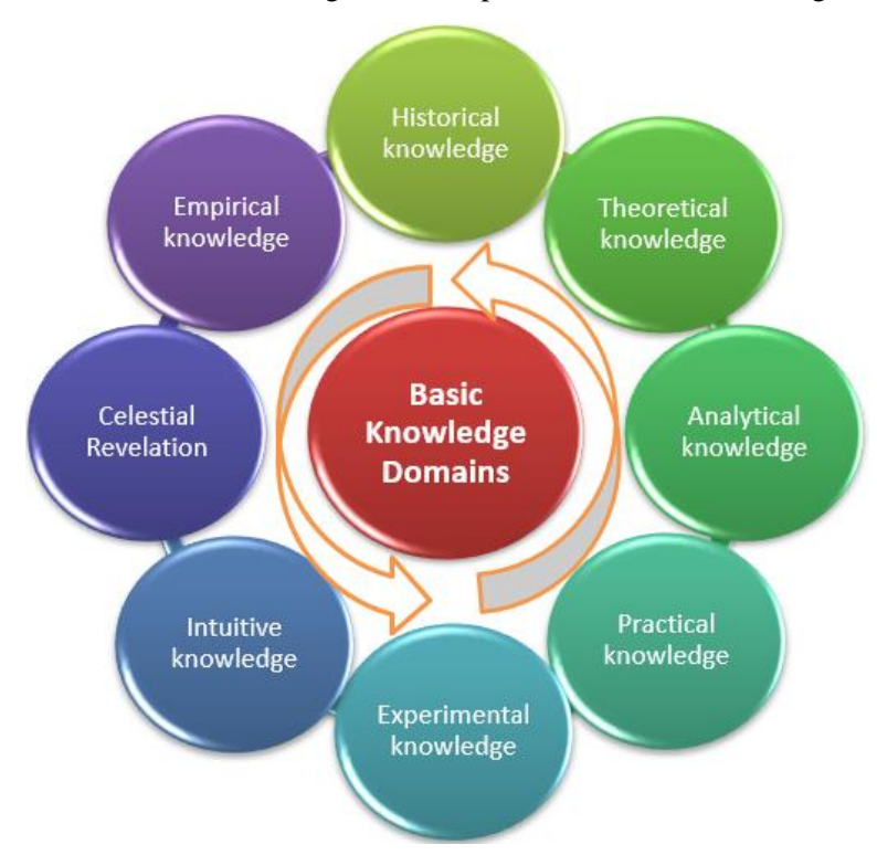
Figure 4. Key knowledge domains

Since the socio-economic environment and ecosystems became so complex and made up of many different sub-environments, including natural, social, technical, spiritual, constructed, and cultural backgrounds, scientific studies tend to be providing their values by the interdisciplinary examination of how biology, geology, politics, law, geology, religion, engineering, chemistry, and economics (Stember, 1998; Szostak, 2007; Moran, 2010). This combination informs humanity's effects on the natural world and civilization. The main dimensions of knowledge in a discipline can be seen in the figure below.