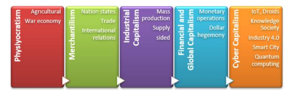
Figure 2. Phases of Capitalism

aimed at solving an issue or problem that is too complex or comprehensive to be adequately addressed by a single discipline or area of expertise" (Klein and Newell, 1998). Abbott (2001) speaks of an increasingly apocalyptic perspective in academia. Geertz (2005) makes a similar observation and states that there has been a kind of disciplinary disorganization in recent years, and everything is mixed in this mess. He says that the foundations have shifted in this mess and that cultural studies dominate the academic world. This point of view also says that it should not be forgotten that any attempt to preserve disciplinary fields as they are tends to decline the complex relationship between knowledge and power. (Değirmenci, 2017). The human being immersed as cyber capitalism acts with this limitless freedom. However, as the dangers, risks, and uncertainties contained like cyber capitalism become apparent, it is seen that the individual who is on the way to becoming addicted to this area is at risk of his privacy, security, and freedom. Cyber capitalism affects language, religion, race, country, nationality, and geography in this context.