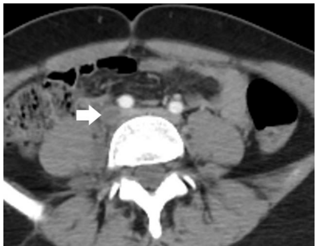
Figure 2: Abdominal CT; Thrombus in The Right Iliac Vein