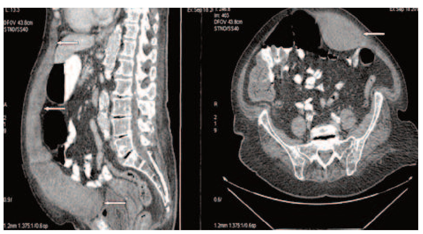
Figure 1. Computed tomography showing long acute hematoma in the left rectus abdominis (Arrows)

Computed tomography (CT) scanning showed a