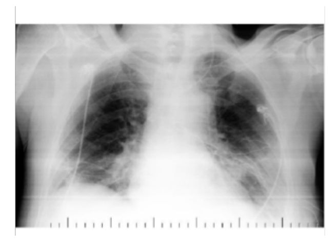
Figure 4. The image of the post-operative postero-anterior chest x-ray.

It was concluded that, the adhesions prevented pneumothorax formation. Fortunately no other intra-thoracic organ damage was detected. The knife was taken out of the thorax in a controlled manner. The parenchymal injury was repaired. The patient was discharged on the 6th postoperative day uneventfully (Fig. 4).