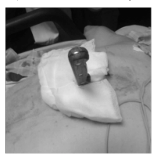
Figure 1. The image of the patient who was admitted to the emergency unit with a knife on his back.

A 75 year old male patient had admitted to the emergency department with the knife on his back. He was lying on a face down position from the moment he was being stabbed on his back. On physical examination a bread knife, penetrating the thoracic cavity from the 8th intercostal space, 2 cm lateral to left paravertebral line was detected (Fig. 1).