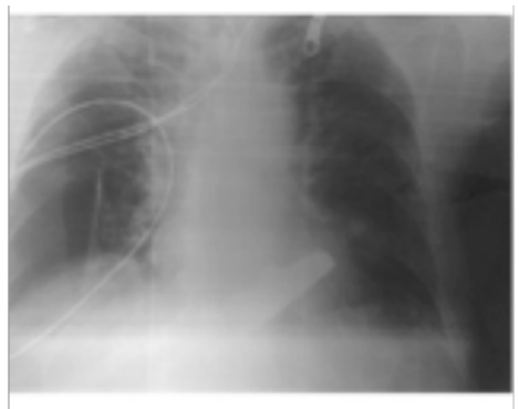
Figure 2. The radio-opaque image of the knife in the mediastinum in the anteroposterior chest x-ray.

The knife was moving simultaneously with the cardiac beats as seen on the monitor. The respiratory sounds were normal on auscultation. His hemoglobin level was 11.7 g/dl. An anteroposterior chest x-ray was taken on lying position and there was no apparent hemopneumothorax. The radio-opaque knife was visible at the cardiac shadow of the mediastinum (Fig. 2).