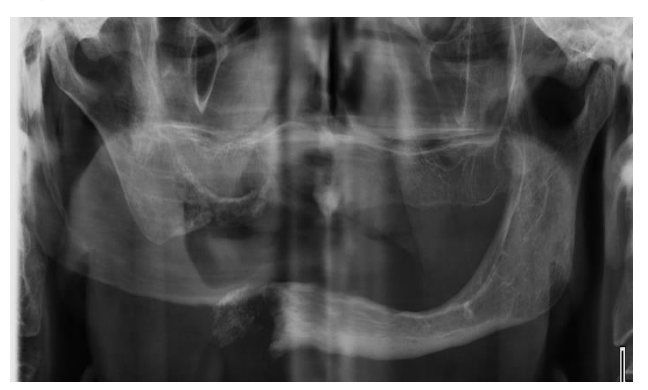
Figure 3. Panoramic radiography

It was determined that there was drainage from the extraoral fistula associated with the fracture. line. Considering the current medical condition of the patient, palliative treatment was planned. Surgical treatment was postponed until the patient's medical condition stabilized. After the antimicrobial washing in the mouth, sequestrotomy was performed. (Figure 4)