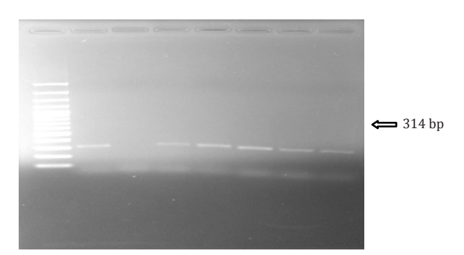
Figure 1. PCR results (1-Marker (100bp), 2- S. aureus 27R ( mecA+ ), 3- S. aureus 25923 ( mecA- ), 4, 5, 6, 7, 8- S. aureus isolates (from veterinarians).

rians and 7 students sampled were carried the phenotypic resistant S. aureus at least to one of samples.