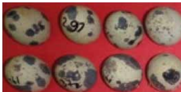
Figure 2. Black spots of varying size on greyish white eggshell colour.