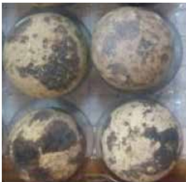
Figure 5. Blue spots of varying size on greyish white eggshell colour.