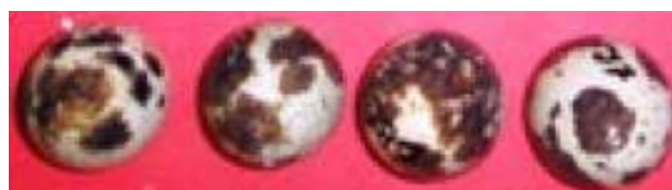
Figure 1. Very large brown spots on greyish white eggshell colour.

Furthermore, the impact of eggshell colour on egg width was also found to be statistically significant ( P < 0.05 ). While the egg length and width values were ascertained to be the highest in Group IV, the egg shape index was the highest in Group II, and elongation values were the highest in Group V.