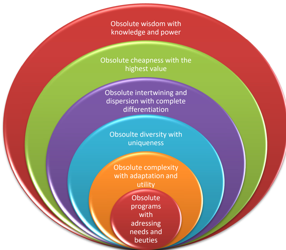
Figure 2. Natural innovation within the continuous and unique creation