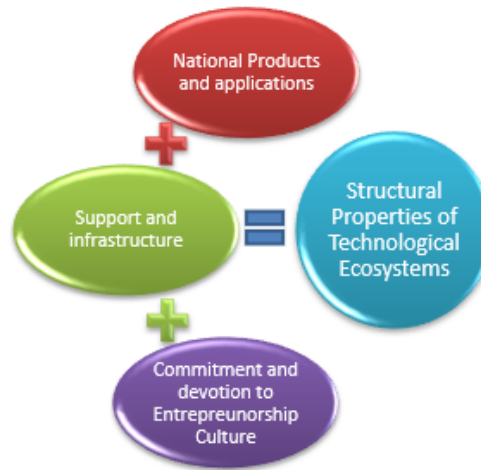
Figure 4. Basic structural requirements of a technological ecosystem