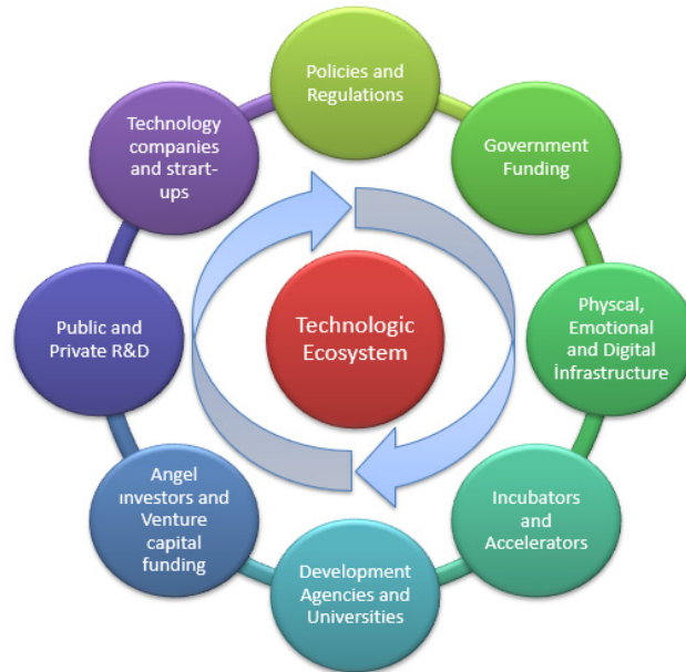
Figure 3. Essential elements of a technological ecosystem

Technologies have three significant roles in an ecosystem: components, products, applications, and support and infrastructure. It is essential to see how these three interrelated components work in harmony, how products and applications emerge in the competitive ecosystem, and how structural properties and infrastructures must be established. The part refers to elements in a more complex top technology. For example, if PCs are leading technology, RAM chips, microprocessors, hard disk drives, etc., used on these PCs can be used.