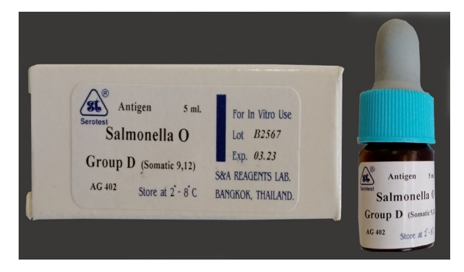
Figure 2. Salmonella spp. antigen for serum plate agglutination (SPA) test to detect seroprevalence.

All the blood samples were collected from non-vaccinated birds. At the same time, data on poultry farm were collected from the farmer. The questionnaire to collect the data on biosecurity practices was prepared according to the previous study (Meher et al., 2020).