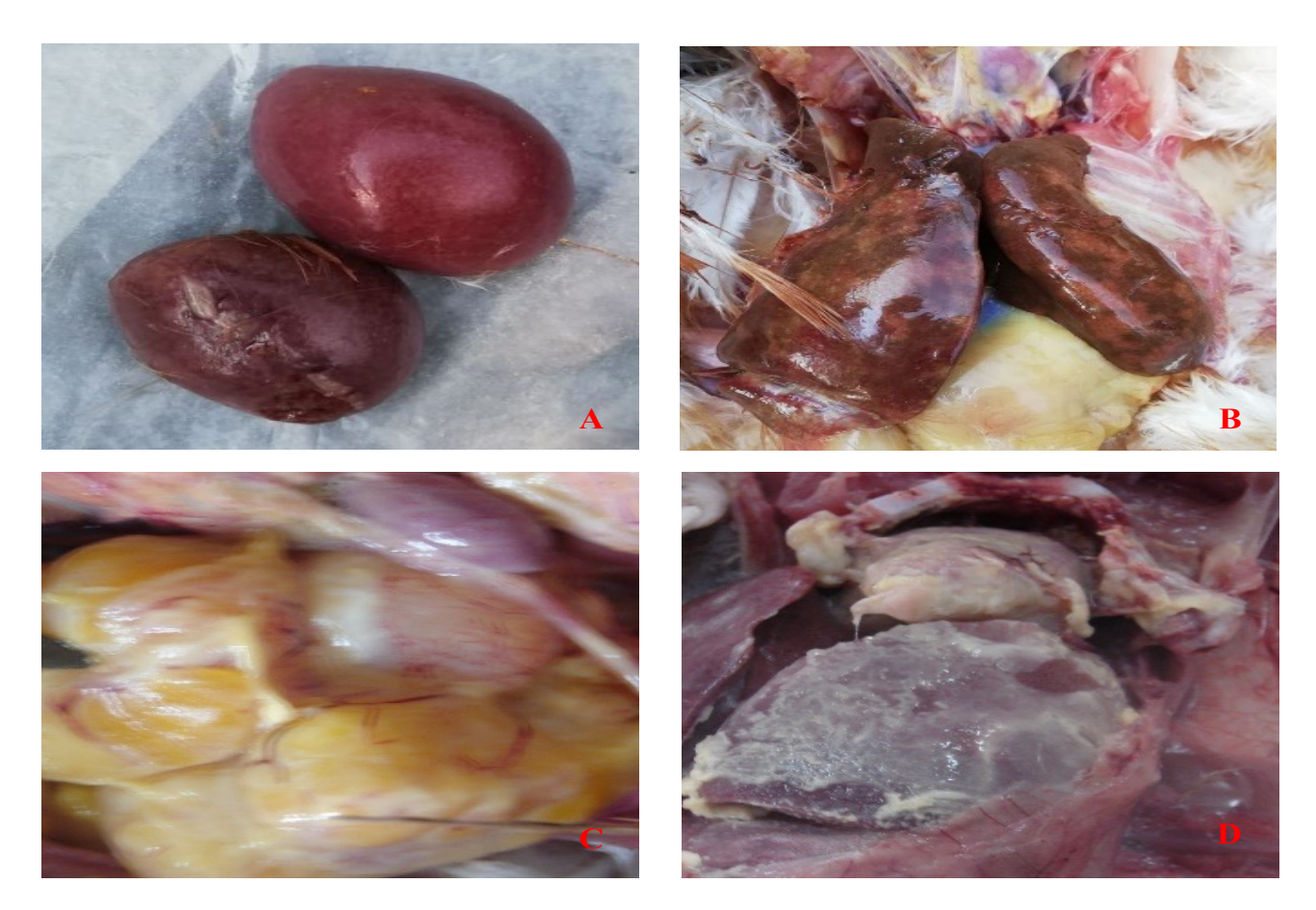
Figure 4. The gross pathological leshions. (A) Spleen larger than normal size with blackish discoloration. (B) Enlaged congested liver with bronze discoloration. (C) Congested and misshapened egg follicles. (D) Pericarditis conjugation with Escherichia coli infection