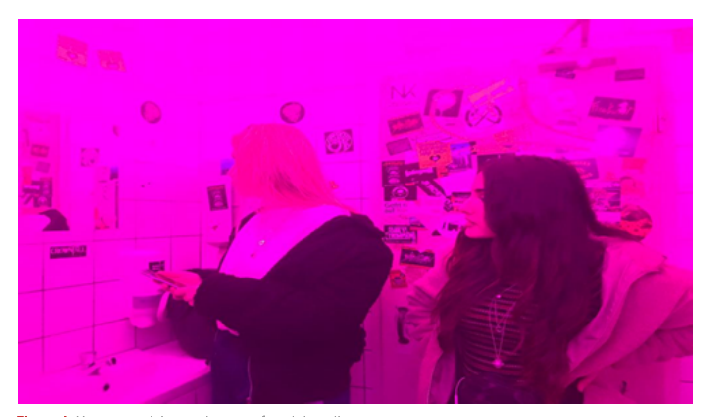
Figure 4. Young people's creative use of social media

traveling in other countries on social media. However, she used a Polaroid camera for more important moments, such as celebrations with family members. The new and valuable memories with Polaroid and black and white photography became more tangible objects for her that can never be lost in digital space. They are too valuable to share in digital environments.