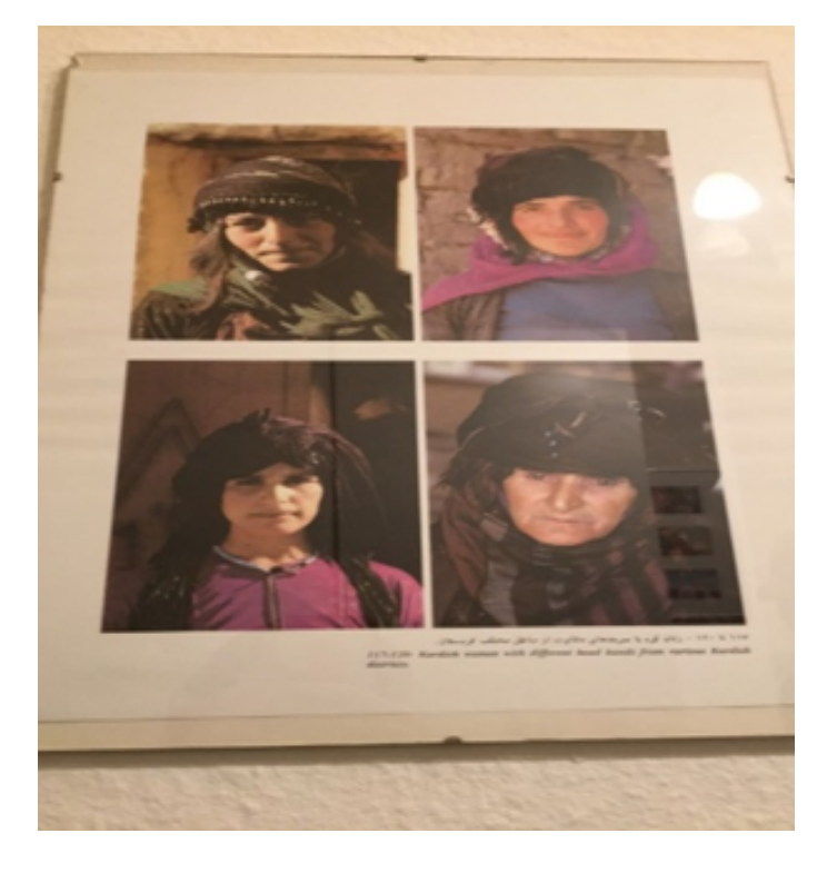
Figure 1. Kurdish women on the wall.

As photographs were opened up, they deepened the talks and confirmed the diversity and ambiguity of identities. There were conventional photos such as marriage photos or the ones about children and their education successes on the walls and around the furniture in most houses. I should acknowledge that my interpretation and their actual meaning could be different. For example, in Hatun's place, pictures of Kurdish women on walls (Figure 1. Kurdish women on the wall) made me think that the photos showed her husband's Kurdish identity. She was a Kurd too, yet she never emphasized it. She said the images were of her choice, not her husband's. Moreover, she did not primarily see Kurdish women in the photo but a culture centered around women, and she was proud of it.