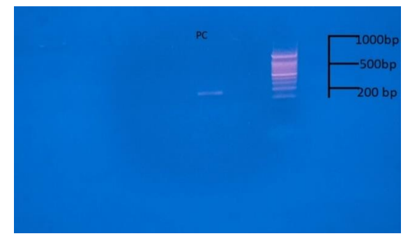
Figure 5. Gel electrophoresis of ermA gene positive control.

Figure 4. Gel electrophoresis of mecA gene positive isolates.