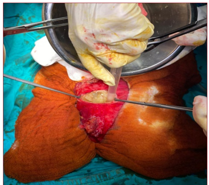
Figure 3. Intra-operative appearance (?)