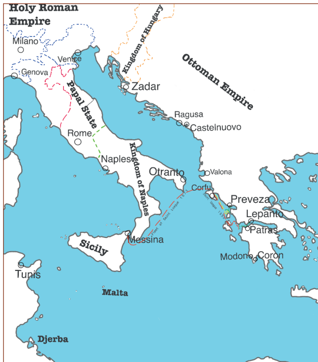
Map 1 The Central-Mediterranean Basin

The correlations of the anti-Ottoman struggles in Hungary and the Mediterranean under Charles V started around 1528-1529. The joining of the Genovese Andrea Doria from the service of Francis I to the Habsburg cause significantly increased Charles V's naval knowledge and the Habsburg dynasty's Mediterranean fighting capabilities. On the other hand, the siege of Vienna in 1529 by Sultan Suleiman caused terror in the Holy Roman Empire, but it also provided lessons to be learned. It is no coincidence that during Suleiman's campaign against Vienna in 1532 the Christian fleet led by Andrea Doria briefly captured Koron and Modon at the southern tip of the Peloponnese peninsula, as well as Patras near Lepanto.