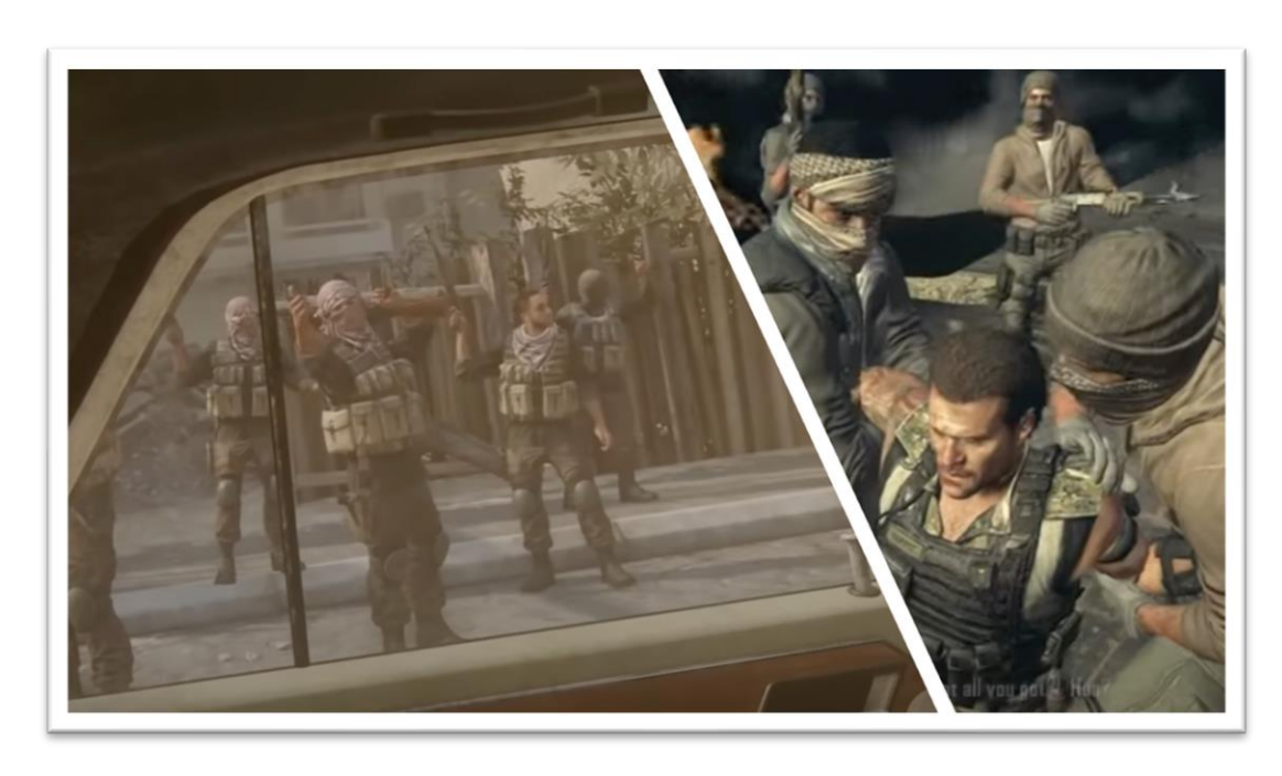
Figure 3. CoD 4: Modern Warfare, (2016) The "bad Arabs." The stereotype of the Arab men that stands as a threat to the western civilization.