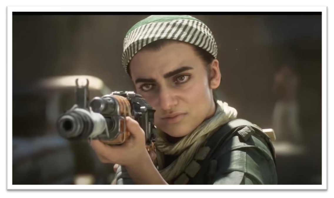
Figure 4. Farah Ahmed Karim, CoD 4: Modern Warfare, (2019) "we'll take care of ours!" Farah is a character represented as the cautious ally of the wester forces. Her ethnicity is not identified, yet she is presented as the defender of the Middle East's deprived society.