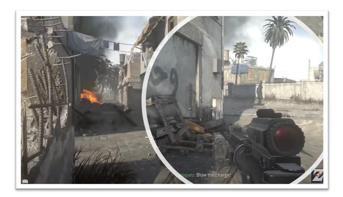
Figure 5. CoD 4: Modern Warfare (2019) Living Spaces, Text, Architecture, Landscape