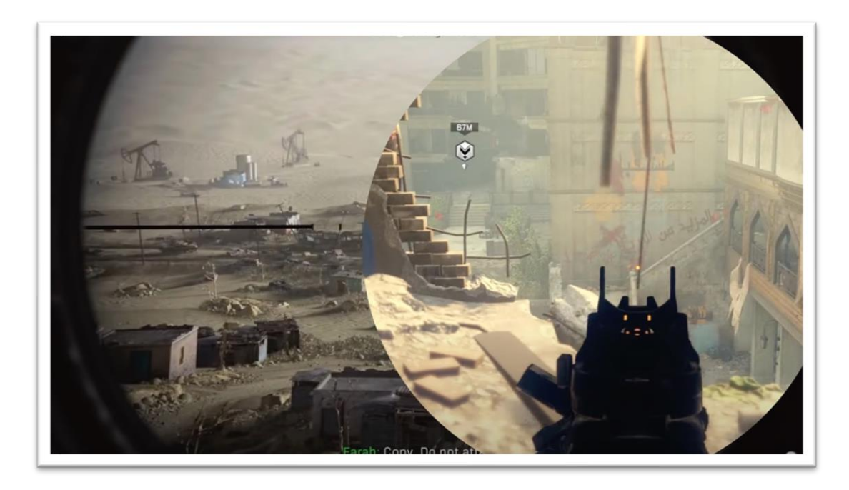
Figure 6. CoD 4: Modern Warfare (2019) and CoD: Black Ops III (2015) Paucity at the gunsight!