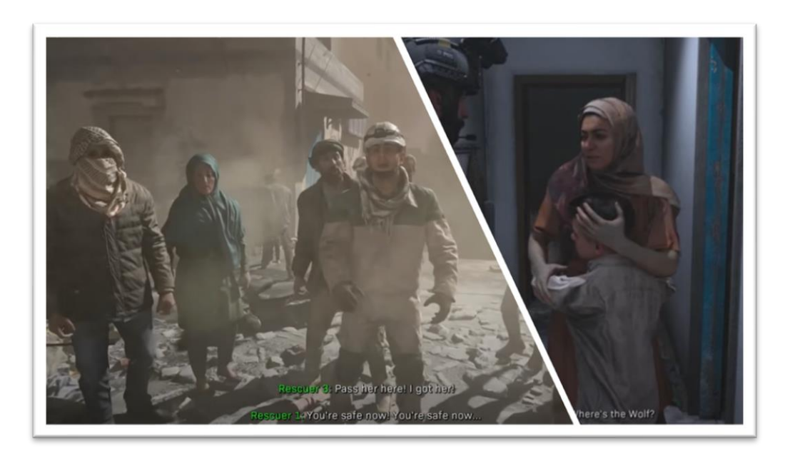
Figure 7. CoD: Modern Warfare Ordinary (2019) Men and Women