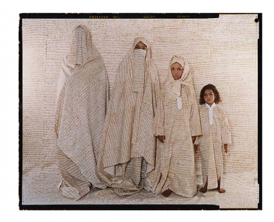
Figure 6: Lalla Essaydi, Converging Territories #30, 2004