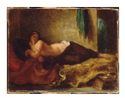
Figure 8: Eugène Delacroix, Odalisque, 1838, Louvre Museum, Paris, France

Another example of Essaydi's reinterpretation is Délocroix's Odalisque (see Figure 8). In this painting Délocroix depicted a woman reclining on a sofa, half-clothed. This photograph can be considered as a perfect example of the misrepresentation of Muslim women as sexual figures. In Essaydi's reimagined photograph, the female figure is fully clothed, but does not wear the headscarf, a difference from Essaydi's other photographs (see Figure 9).