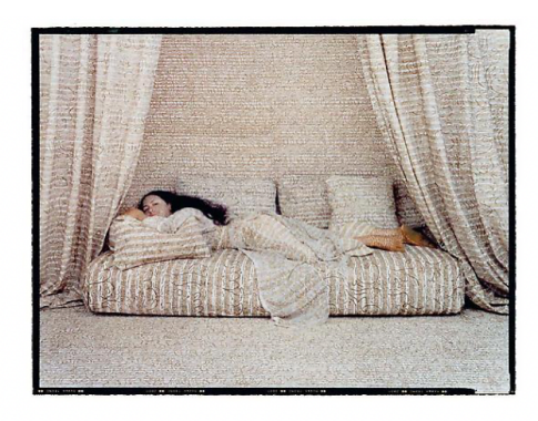
Figure 9: Lalla Essaydi, Les Femmes du Moroc #28, 2005.

It is suitable to say that this difference mainly depends on a woman's status in Muslim society. According to Islamic Law, an odalisque is a female slave, or "kept woman," who do not wear the headscarf. Wearing the headscarf is an obligation for women who have freedom, not slaves. It is with this reality in mind that Essaydi's compositions feature women figures without headscarves when they are in the role of slaves, but still maintain their decency in modest clothes.