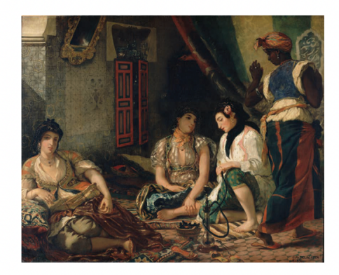
Figure 6: Eugène Delacroix, Algerian Women in Their Apartment, 1834.