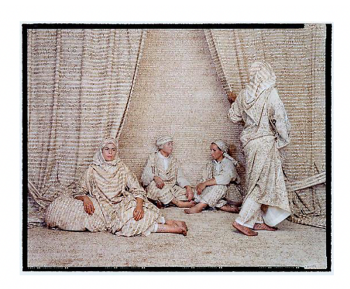
Figure 7: Lalla Essaydi, Les Femmes du Moroc #1, 2005.

Another example of Essaydi's reinterpretation is Délocroix's Odalisque (see Figure 8). In this painting Délocroix depicted a woman reclining on a sofa, half-clothed. This photograph can be considered as a perfect example of the misrepresentation of Muslim women as sexual figures. In Essaydi's reimagined photograph, the female figure is fully clothed, but does not wear the headscarf, a difference from Essaydi's other photographs (see Figure 9).