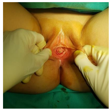
Figure 2. Postoperative photograph of the hymen.

Yazar Katkıları: Çalışma konsepti/Tasarımı: BÖ, ÇAA, CÇ; Veri toplama: BÖ, ÇAA, CÇ; Veri analizi ve yorumlama: BÖ, ÇAA, CÇ; Yazı taslağı: BÖ, ÇAA, CÇ; İçeriğin eleştirel incelenmesi: BÖ, ÇAA, CÇ; Son onay ve sorumluluk: BÖ, ÇAA, CÇ; Teknik ve malzeme desteği: ÇAA, CÇ; Süpervizyon: ÇAA, CÇ; Fon sağlama (mevcut ise): yok Etik Onay: Bu çalışma editöre mektup niteliğinde olup, etik kurul onayına gerek yoktur.