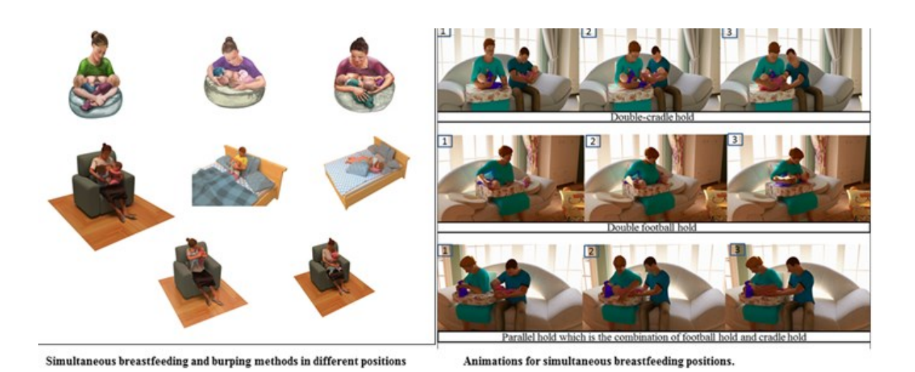
Figure 2. Images and animations for breastfeeding positions.

The descriptive characteristics of the pregnant women and findings regarding their pregnancy are given in Table 1.